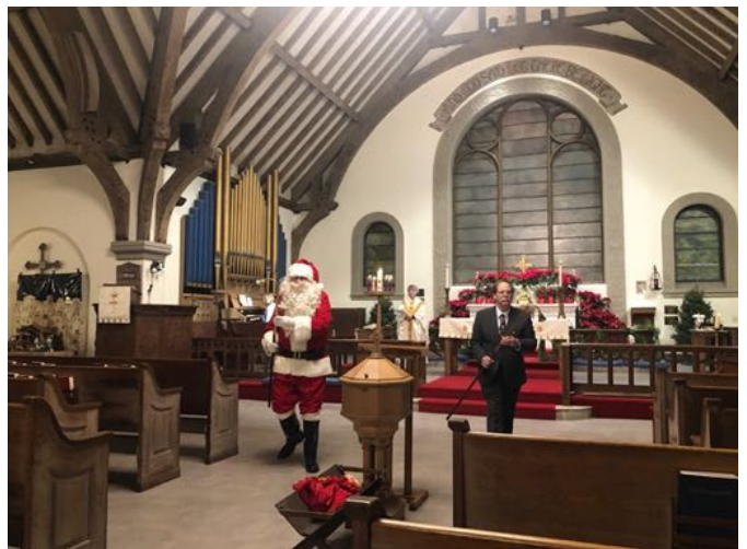
Who's that guy in the red suit?