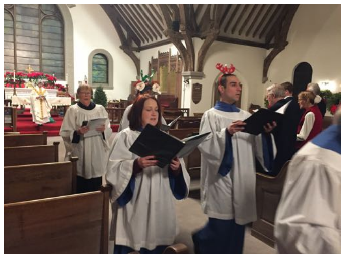
The Trinity Choir recessing