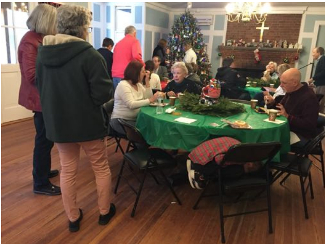
Advent 4 Brunch- Dec 22