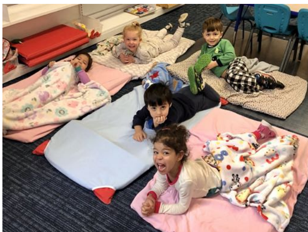
Preschool enjoying our monthly Pajama Party!