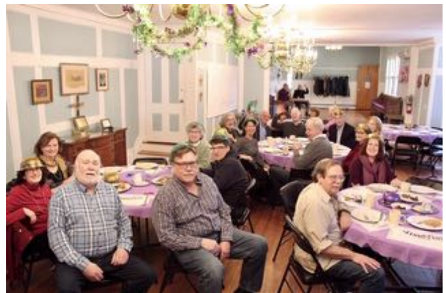
The Mardi Gras Crowd