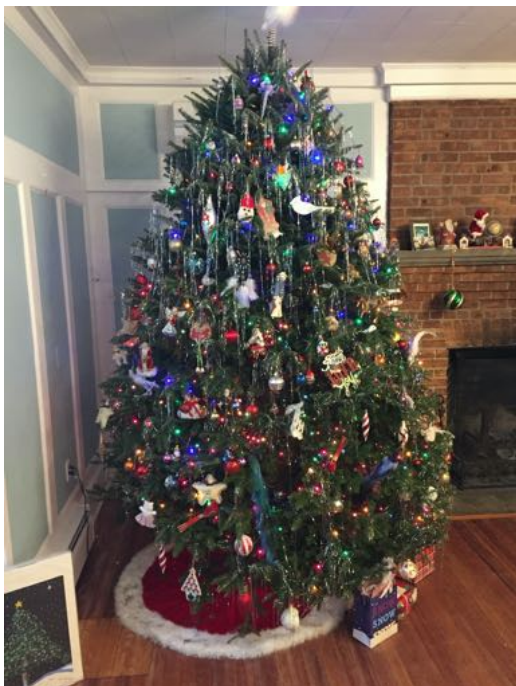
Our beautiful Christmas Tree