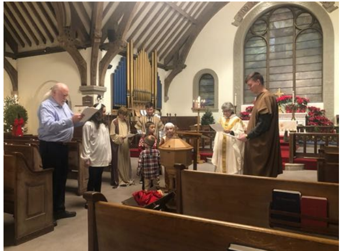
Children's service, 4:00