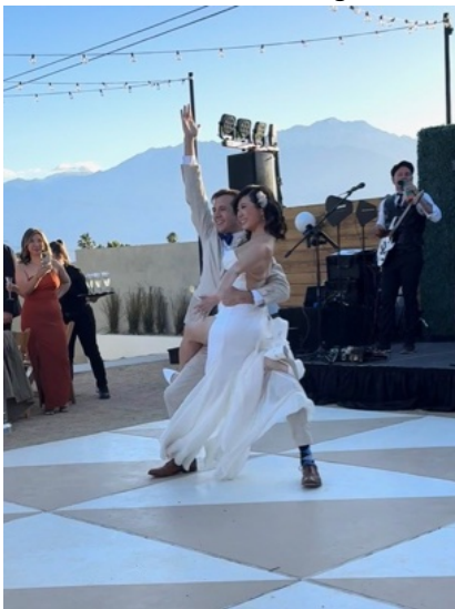
Conclusion of their first dance