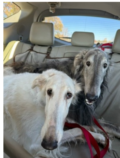
These 4yr old Borzoi rescues (siblings) were picked up by Fr George & brought home from Verona, NY We can't wait to meet them!