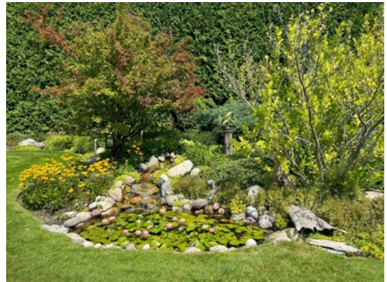
Sarane Ross' lily pond in MI