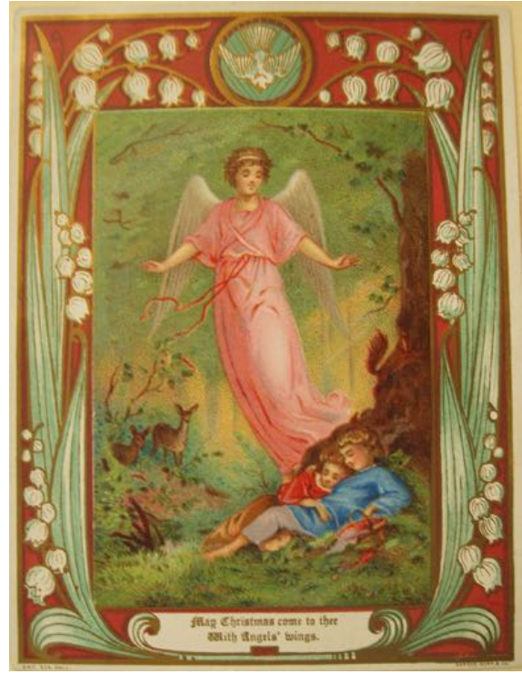
Religious Christmas card, Marcus Ward & Co., about 1870, England. Victoria and Albert Museum, London

Look out for a good variety of music (new and old) from the Trinity choirs this festive season!