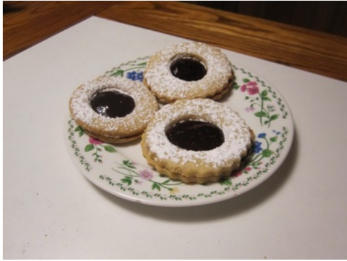
Mini Linzer Cookies