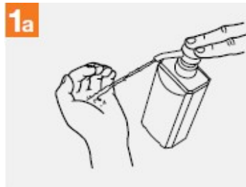
1a Apply a palmful of the product in a cupped hand, covering all surfaces;