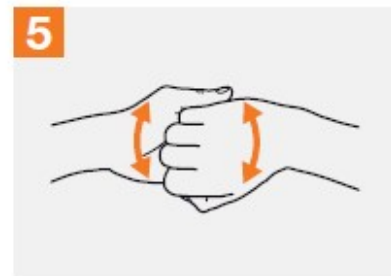
5 Backs of fingers to opposing palms with fingers interlocked;