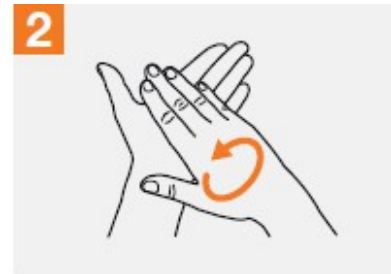
2 Rub hands palm to palm;