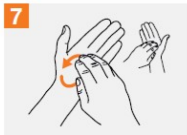
7 Rotational rubbing, backwards and forwards with clasped fingers of right hand in left palm and vice versa;