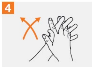
4 Palm to palm with fingers interlaced;