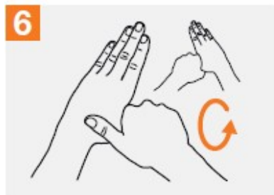
6 Rotational rubbing of left thumb clasped in right palm and vice versa;