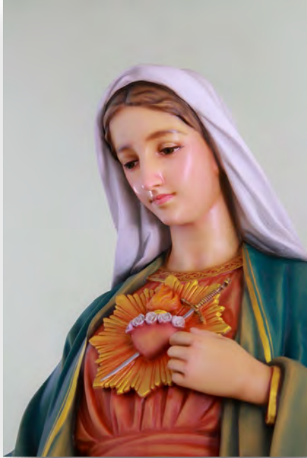
August is dedicated to the Immaculate Heart of Mary