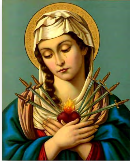
September is dedicated to Our Lady of Sorrows and the Seven Sorrows of Mary