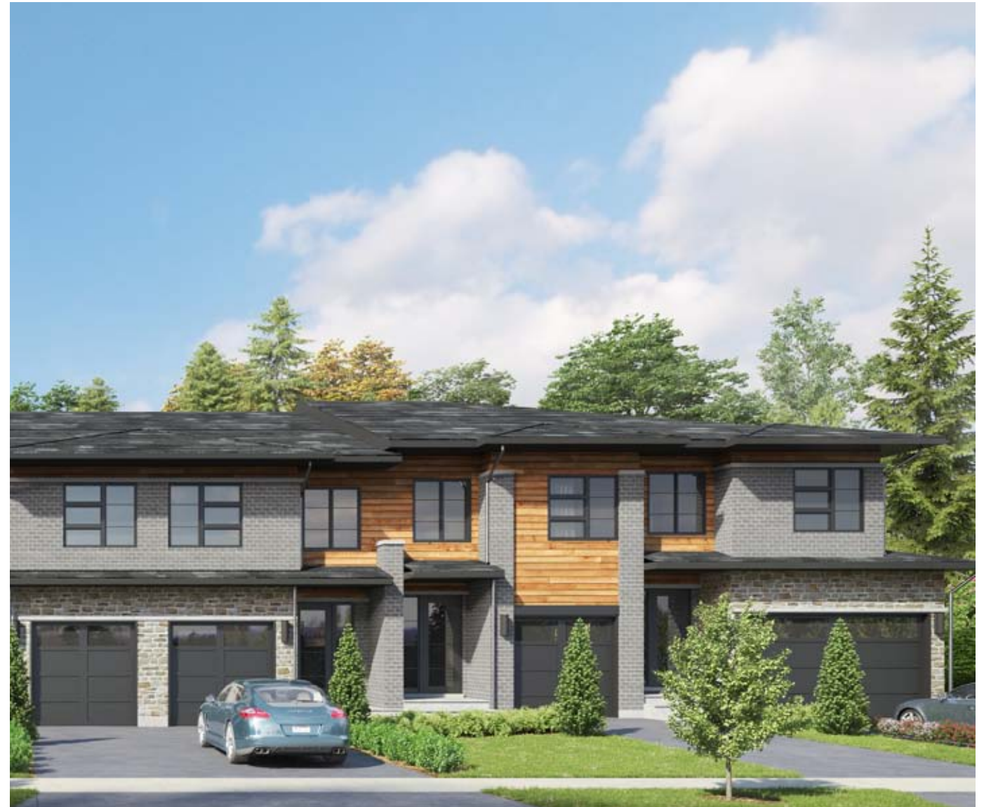
Series 2: Grey Exterior