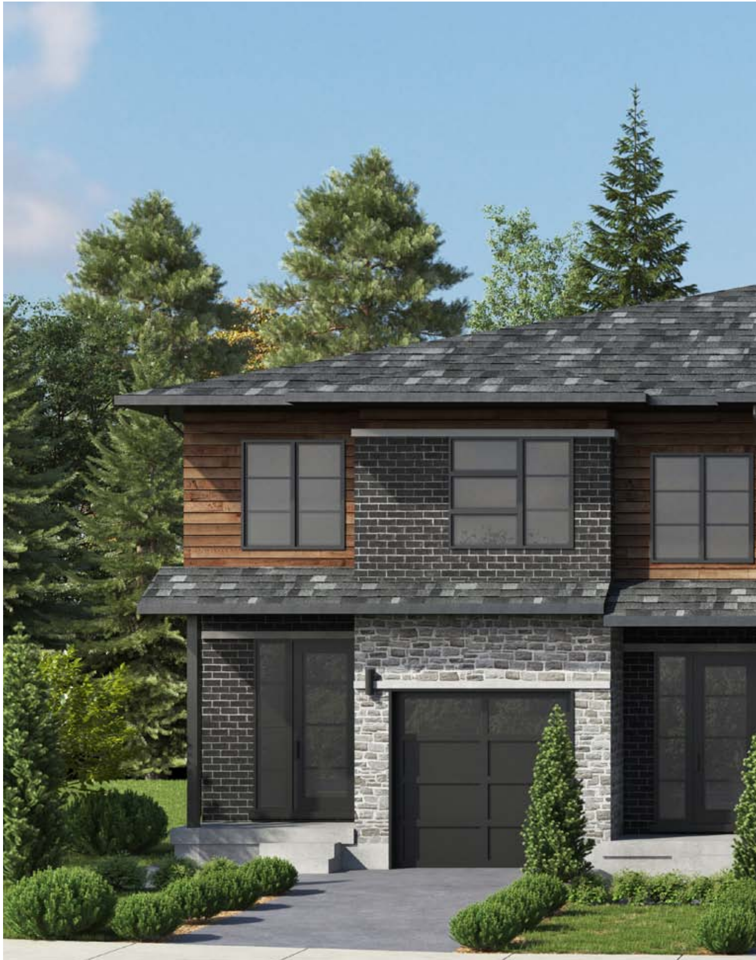
Series 1: Black Exterior