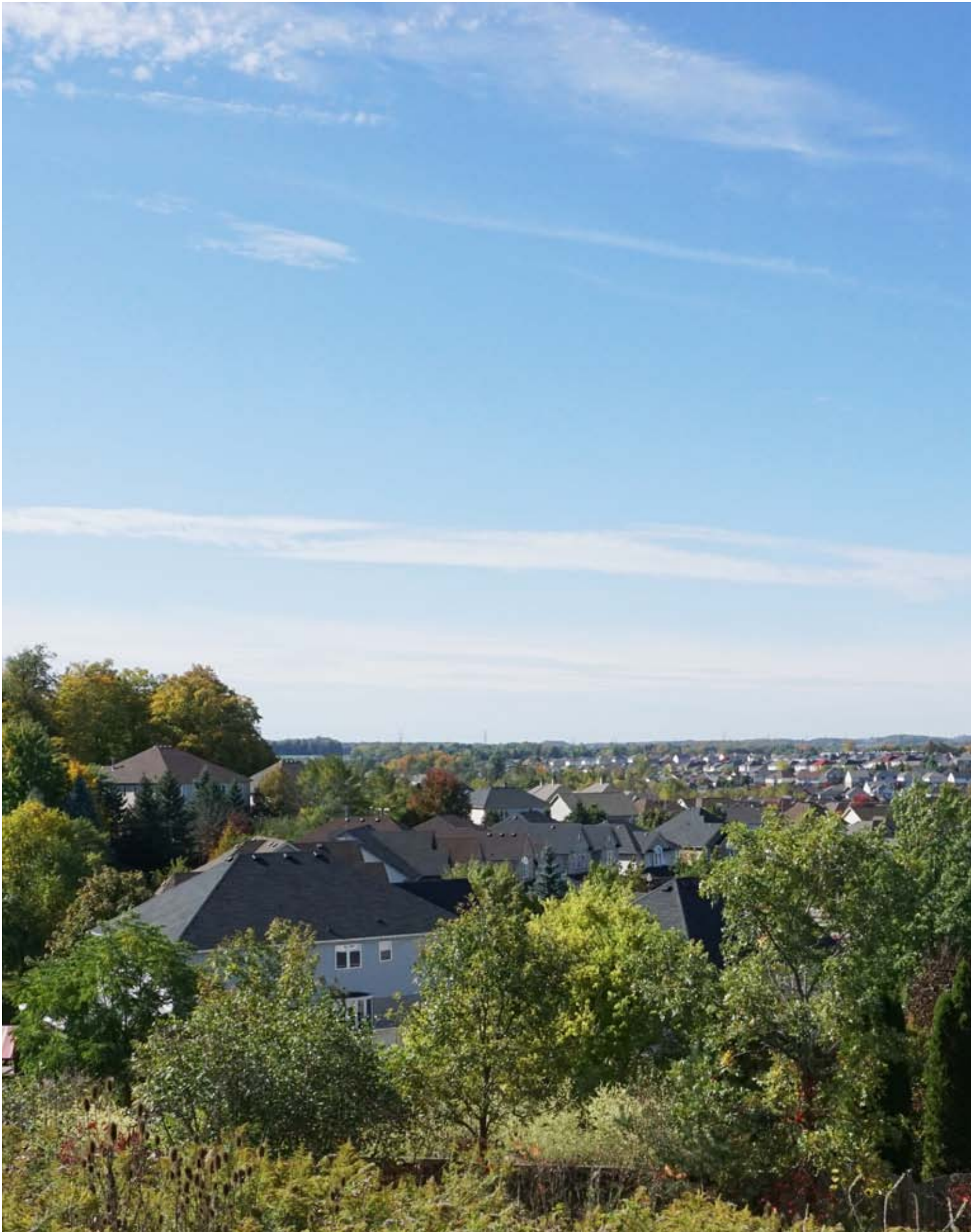
Overlooking the Doon Neighbourhood