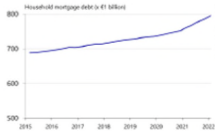
Chart 1: Total mortgage debt