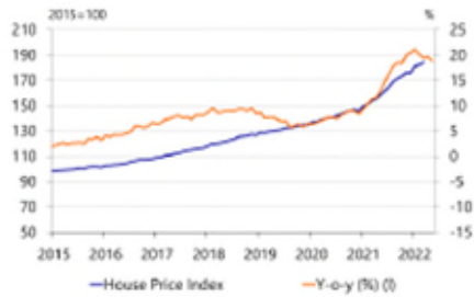
Chart 3: Price index development