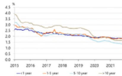
Chart 4: Interest rate on new mortgage loans