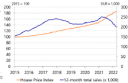
Chart 2: Sales