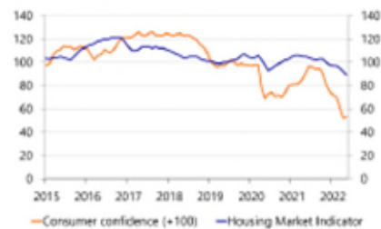
Chart 6: Confidence