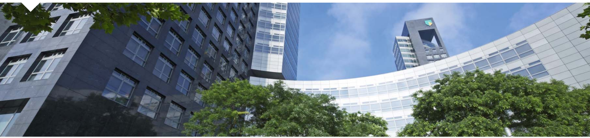
20190313 Investor Relatio