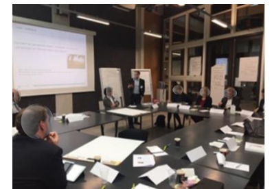
Photos have been blurred to protect privacy.