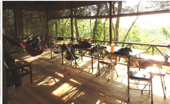
Canteen social area