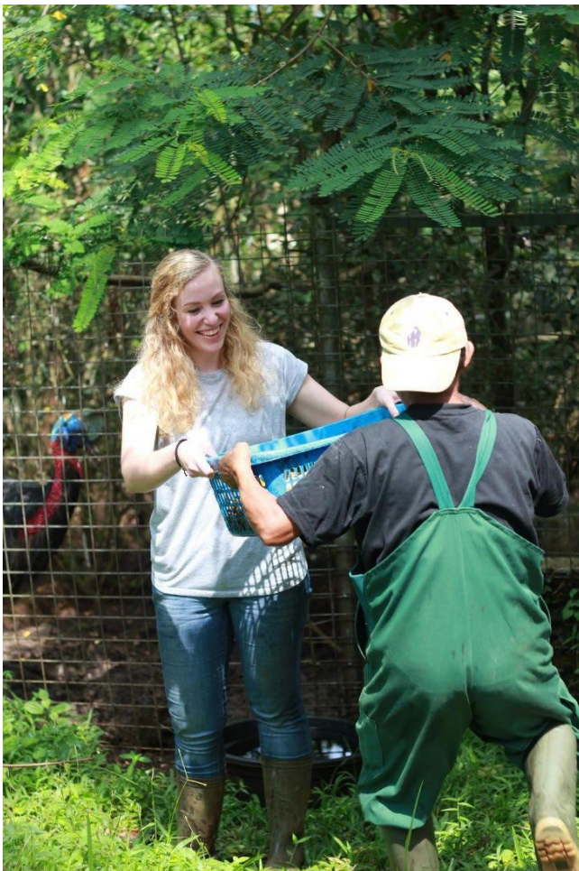
Helping feed Cassowaries