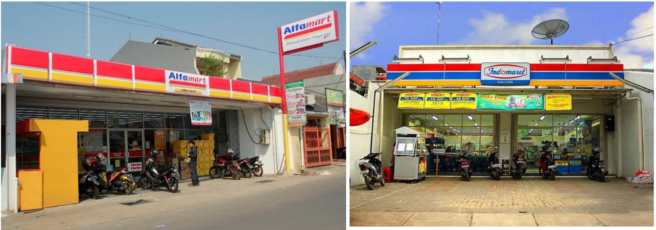
Typical shop fronts