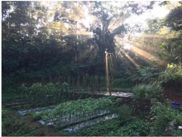
Farm 1 in the morning sun