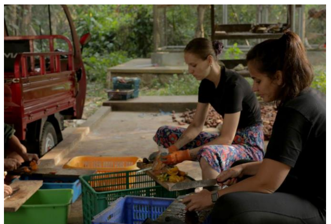
Top: Asian Short Clawed Otters Bottom: Morning food prep