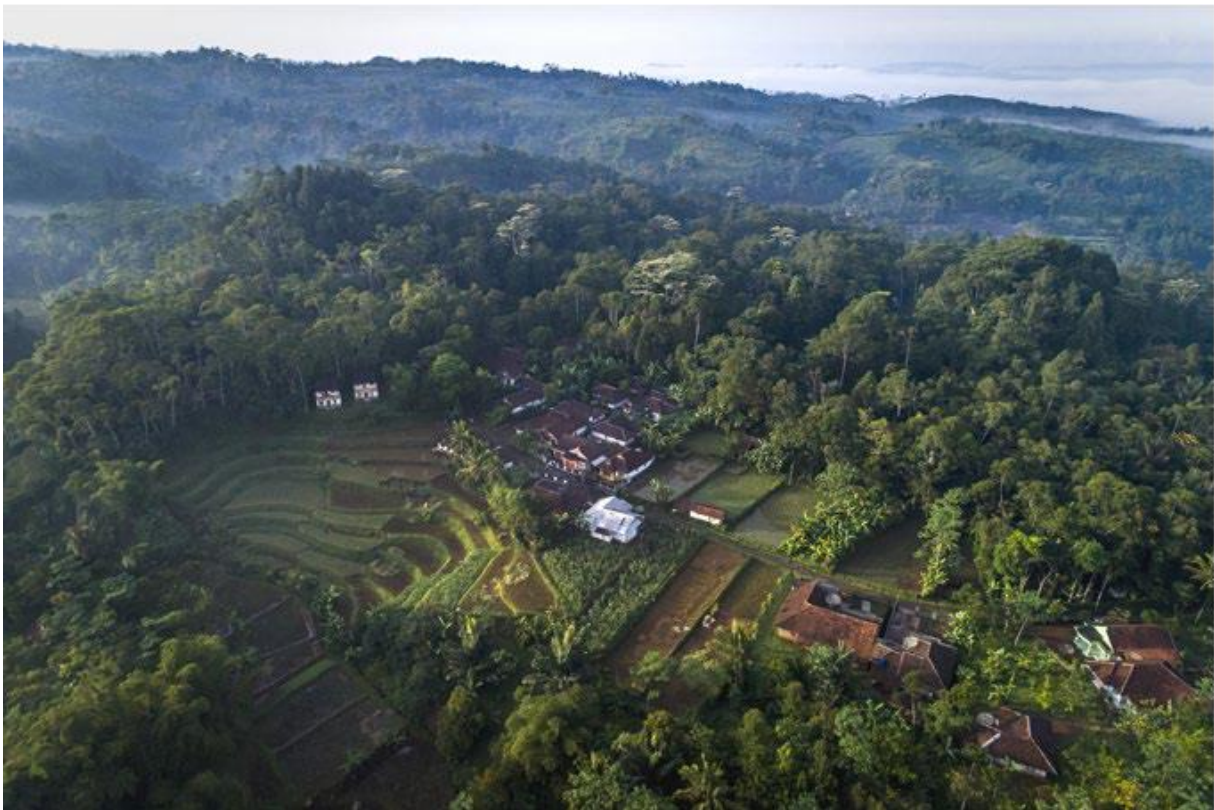
An aerial view of Cikananga village

It is important you ensure that you have appropriate health and travel insurance before traveling.