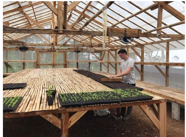
Volunteers helping on the farm