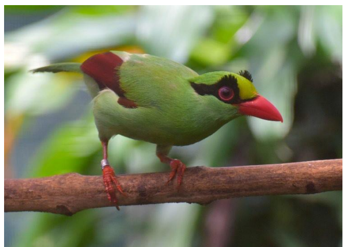
Javan Green Magpie