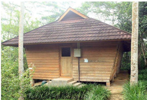
Front of dormitory