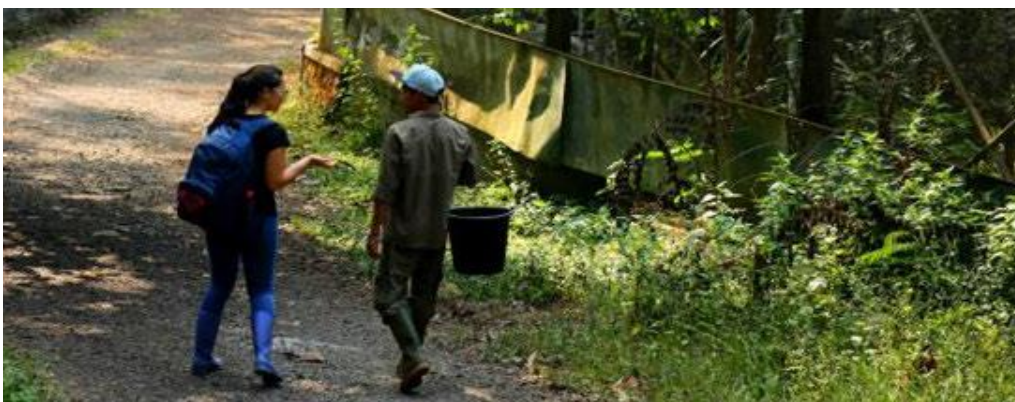
A sunny morning stroll to feed the animals!