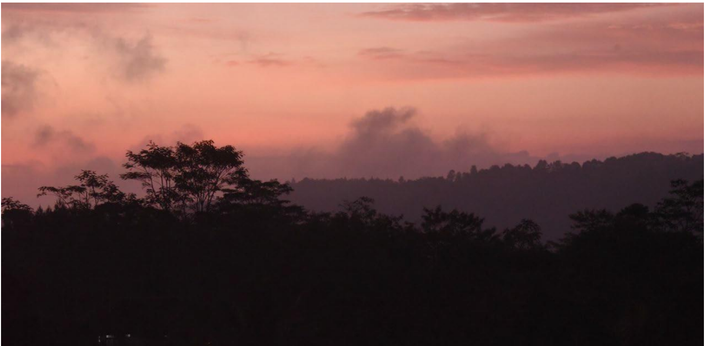
Typical sunset from the canteen