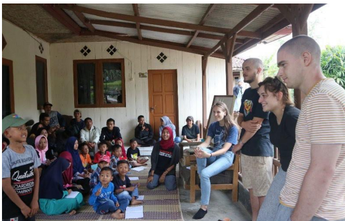
Teaching English to local children

Some of these trips and tours have associated costs are not included in the volunteer fee.