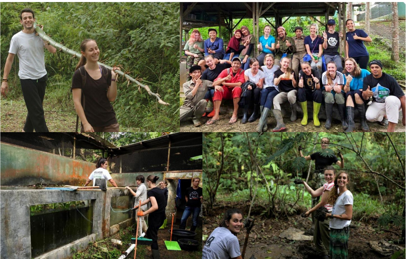
At Cikananga there is a real team atmosphere!