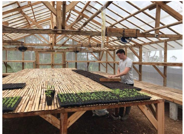
Volunteers helping on the farm