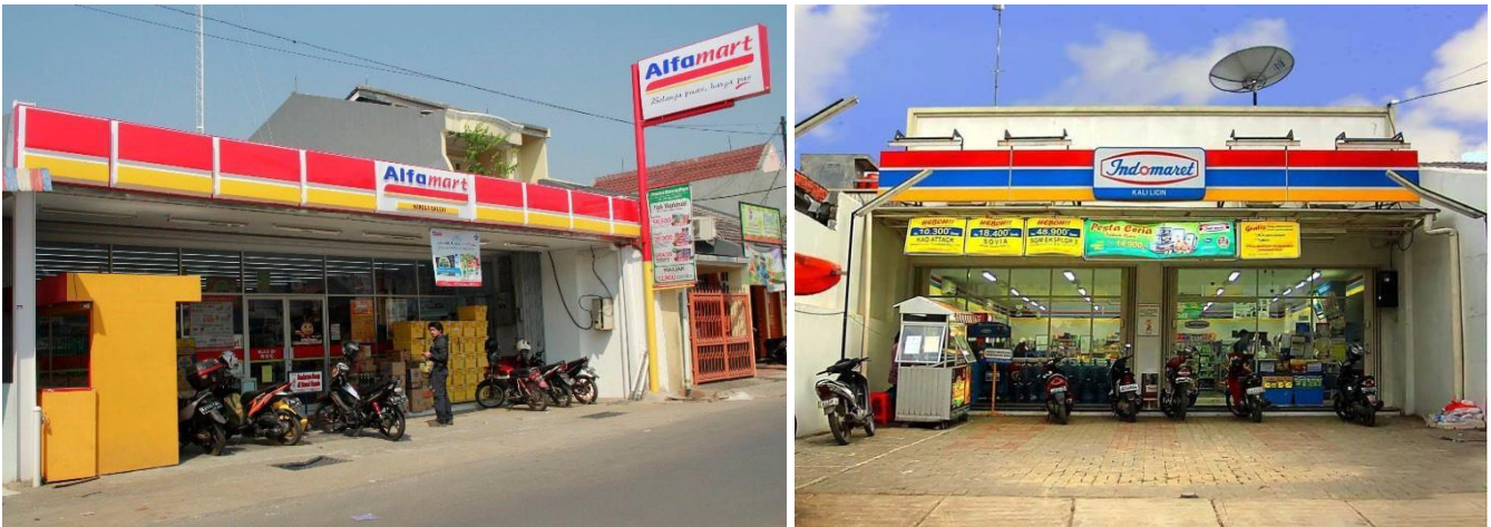
Typical shop fronts