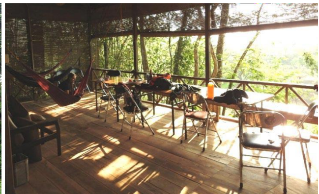
Canteen social area