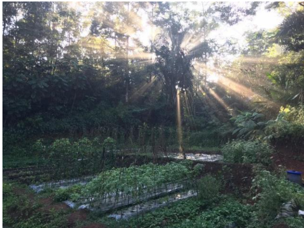
Farm 1 in the morning sun