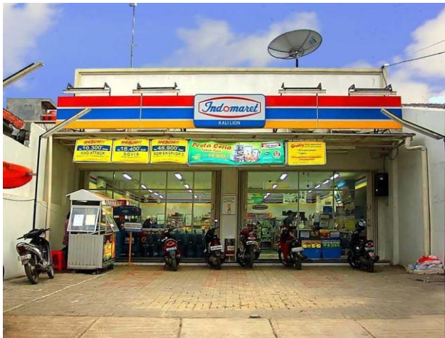
Typical shop fronts