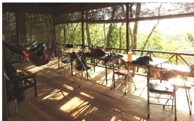
Canteen social area