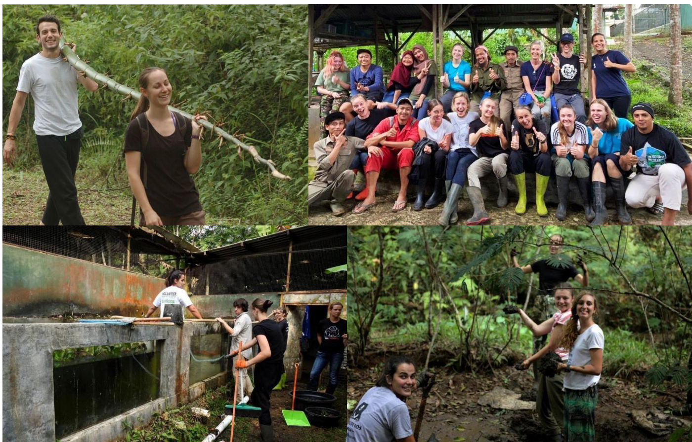
At Cikananga there is a real team atmosphere!