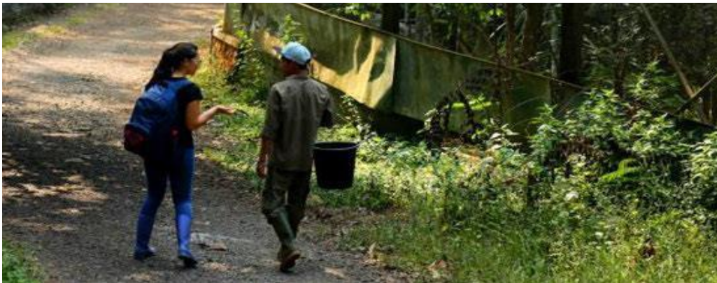
A sunny morning stroll to feed the animals!