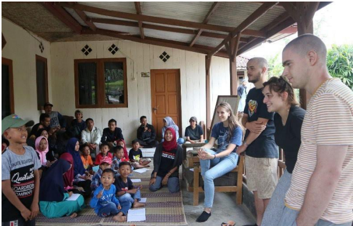
Teaching English to local children

Some of these trips and tours have associated costs are not included in the volunteer fee.