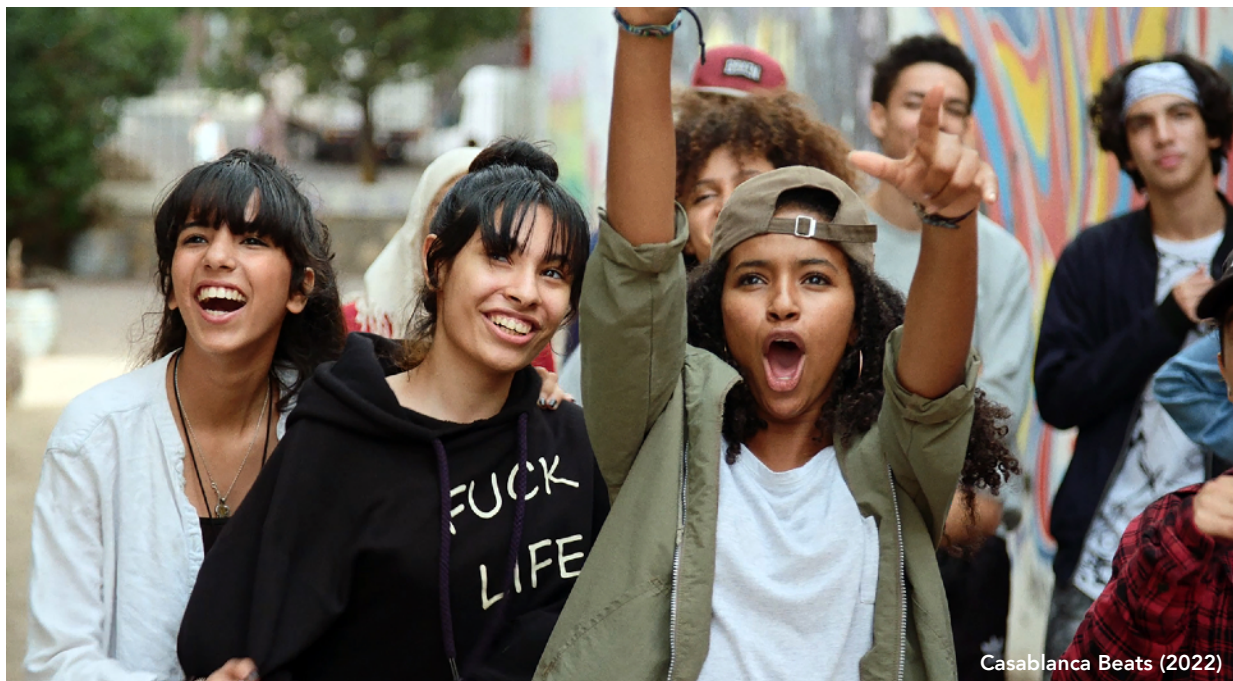
Casablanca Beats (2022)

The TIFF Next Wave Film Festival features FREE movies for anyone under 25, including new releases from around the world, amazing guests and Q&A sessions, special events, industry workshops and talks, the ever-epic kick-off at Battle of the Scores, and more!