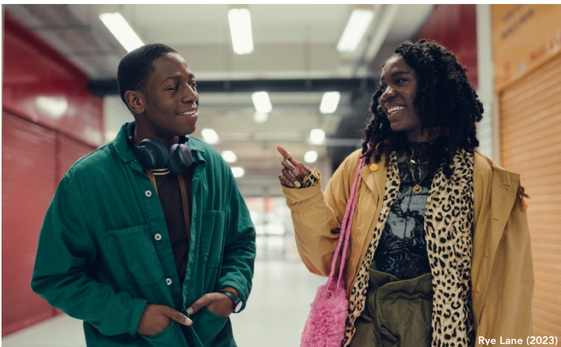
Rye Lane (2023)

The TIFF Next Wave Film Festival returns April 14–16 , with bold new films from around the world featuring diverse and authentic representations of youth on screen. Highlights include: a special advance screening of Raine Allen-Miller's heartwarming debut film Rye Lane , following two broken-hearted twenty-somethings on a mayhem-filled day through South London; the Opening Night Film Adolfo from Mexican director Sofía Auza, which follows two strangers who meet by chance at a bus stop and decide to find a new home for their beloved cactus companion; So Yun Um's hybrid documentary-memoir Liquor Store Dreams , asking resonant questions of racial inequality, reconciliation, and generational healing through the story of Korean liquor store owners and their families in Los Angeles; and up-and-coming director Charlotte Regan's funny and touching feature debut Scrapper , about a precocious young girl and her unreliable father who struggle to connect.