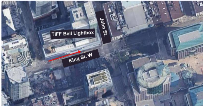
Figure 4: Map of TIFF Bell Lightbox rush line from an aerial view

Located outside TIFF Bell Lightbox on the west side of the King Street entrance and extends towards Widmer Street.