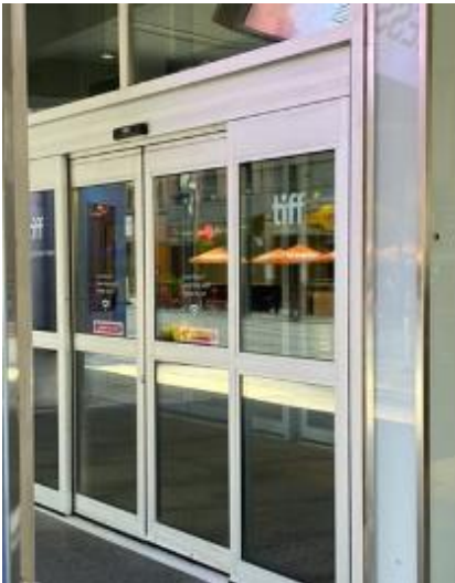
Figure 3: The larger doors on the right side have movement sensors which will automatically open for you.