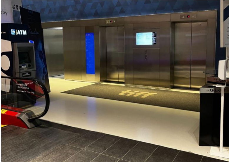
Figure 6: Photograph of the two metal elevators on the right side of the Atrium beside the escalators.