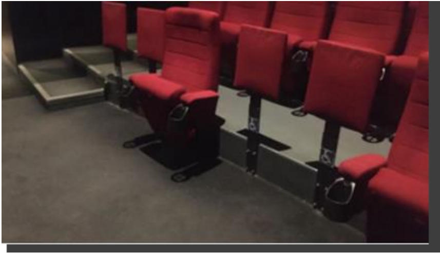
Figure 12: Example of companion seat location

A typical cinema seat beside an accessible seat that is reserved for use by companions of those requiring accessibility accommodations