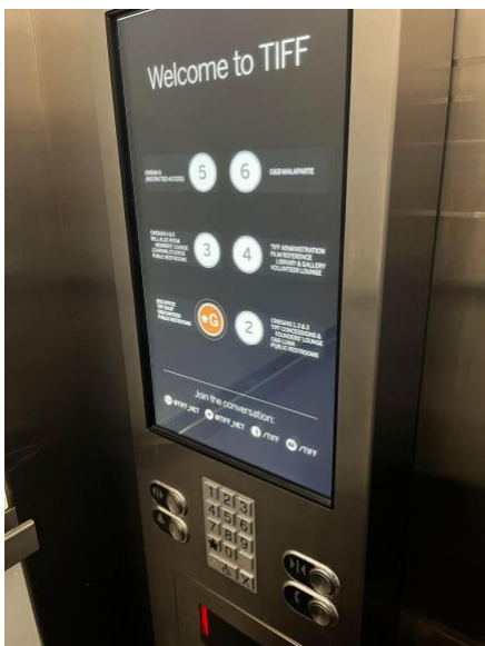
Figure 7: Photograph of elevator touchscreen and keypad underneath