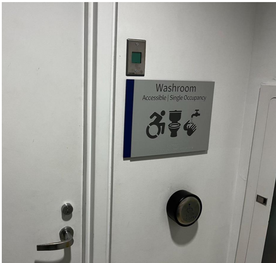
Figure 14: Washroom signs will indicate facilities available inside.