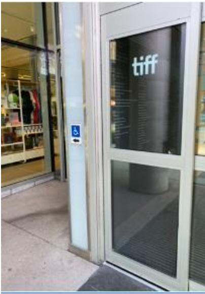
Figure 2: The door on the left side has a pressure sensitive plate for opening.