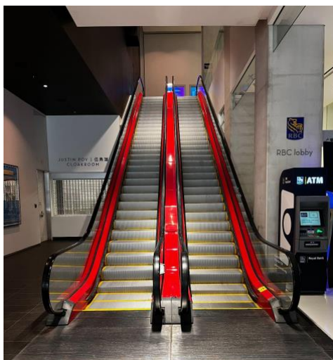
Figure 5: Photograph of the escalators in the front lobby of TIFF Bell Lightbox. The escalator to the right will allow you to move upwards to the second floor.