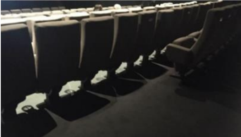
Figure 10: Example of accessible empty spaces