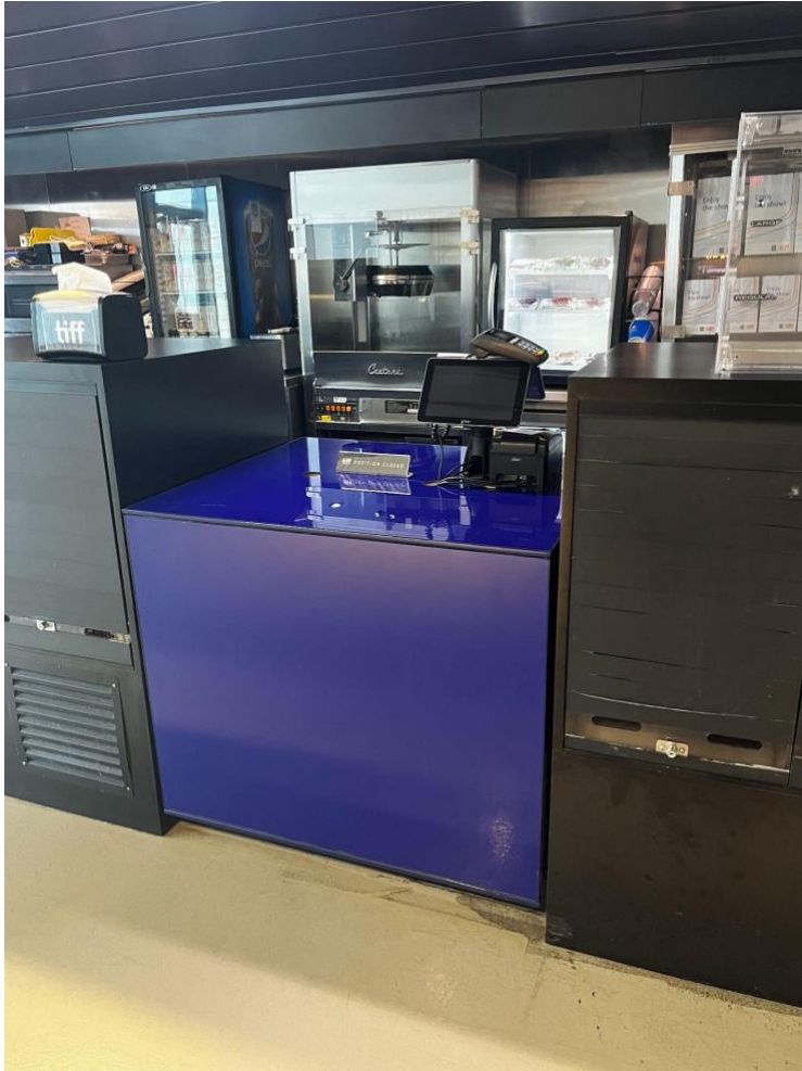
Figure 13: Photograph of concession stand counters