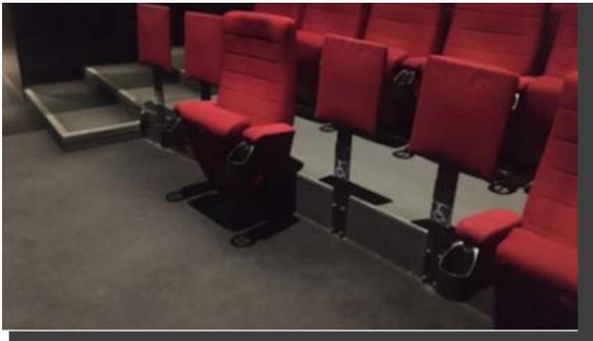
Figure 12: Example of companion seat location

A typical cinema seat beside an accessible seat that is reserved for use by companions of those requiring accessibility accommodations