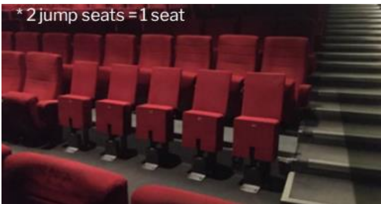
Figure 11: Example of jump seating found in cinemas