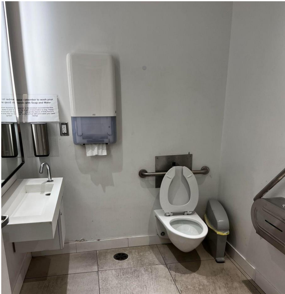
Figure 15: Example image of the washroom in Atrium. The washroom can be found underneath the back of the escalators.