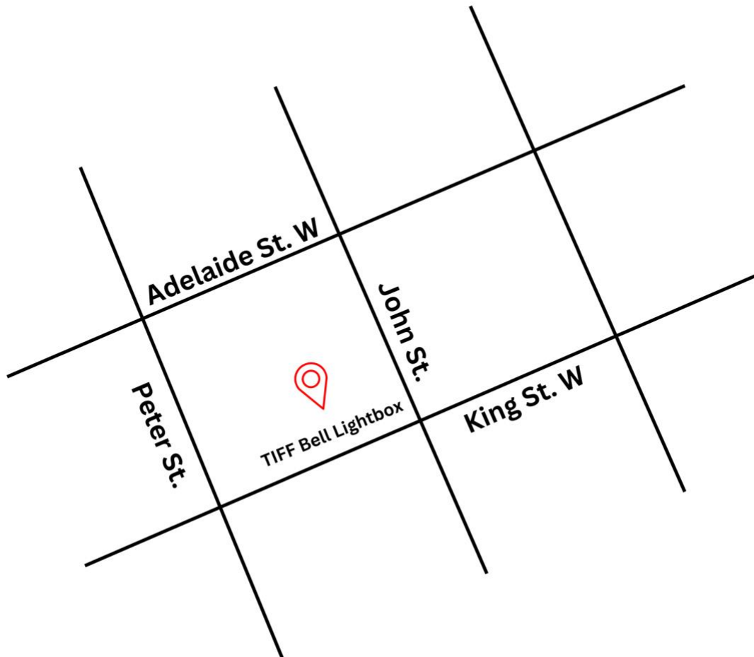
Figure 1: A Map of downtown Toronto with TIFF Bell Lightbox between John St. and Peter St. to the West and East and Adelaide St. W. and King St. W. to the North and South.