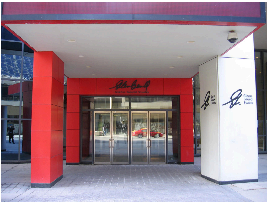
Figure 2: image of the Glenn Gould Studio and Conference Centre main entrance.