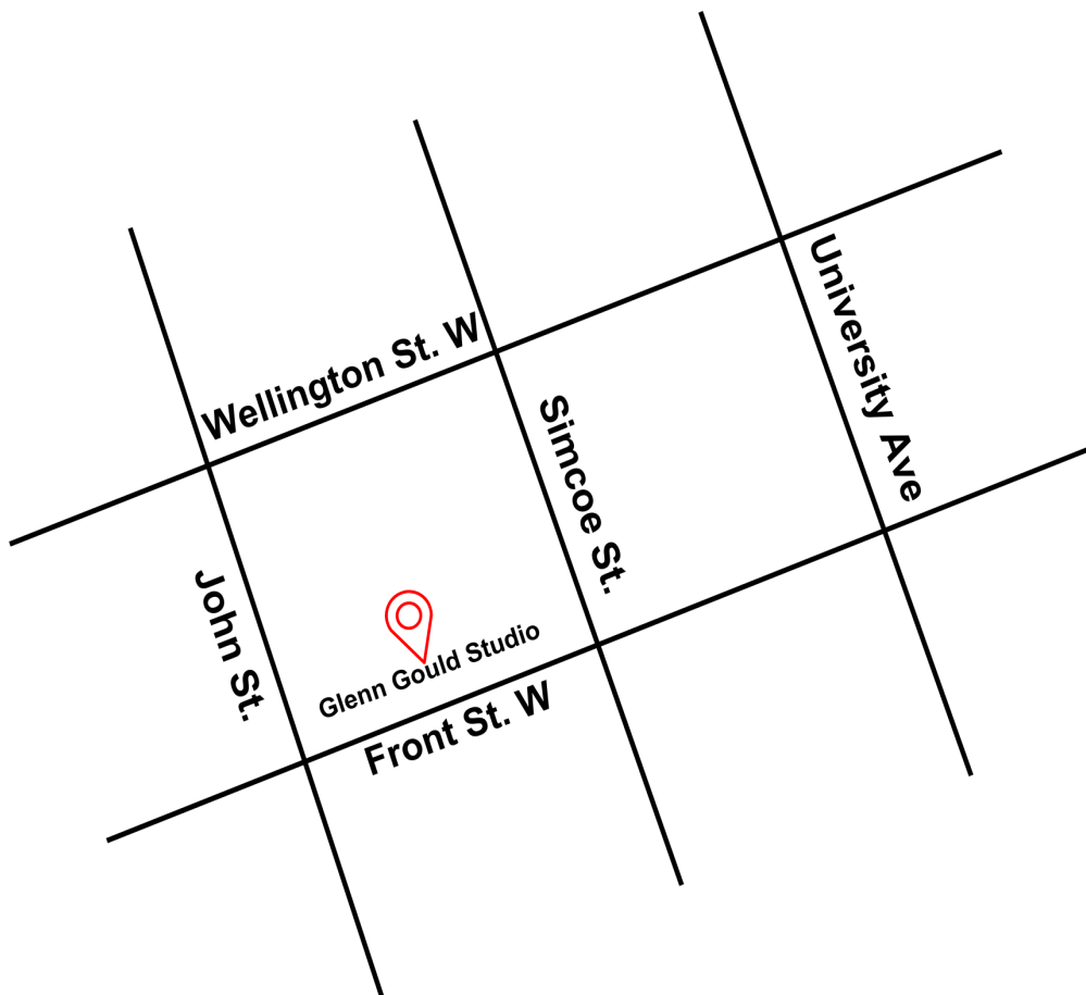
Figure 1: Map of downtown Toronto with Glenn Gould Studio at Front St. W. and John St., with Wellington St. W. to the north