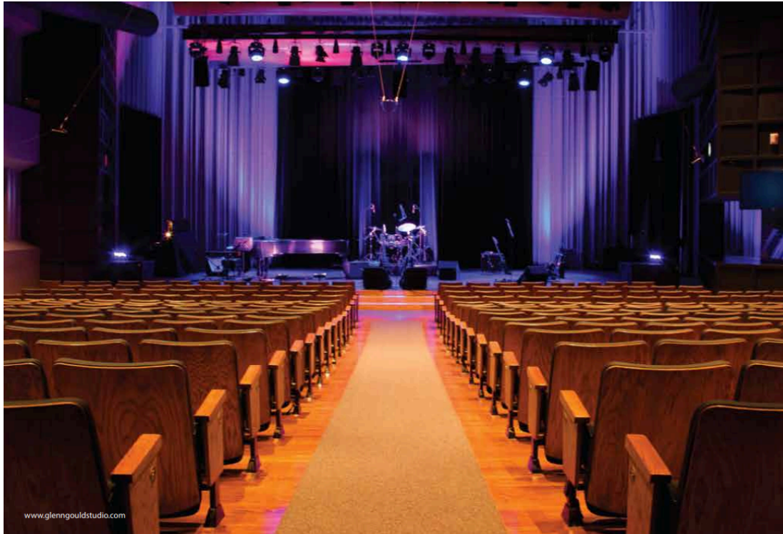
Figure 5: image of the Glenn Gould Studio