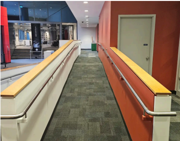
Figures 3-4: image of the ramp that gives access to the Glenn Gould Studio and the Conference Centre main entrance