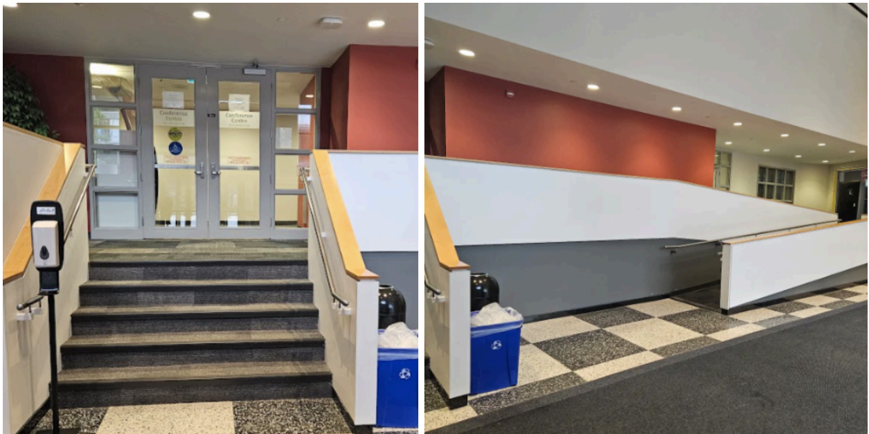
Figures 9-10: stairs and ramp that give access to the Conference Centre entrance