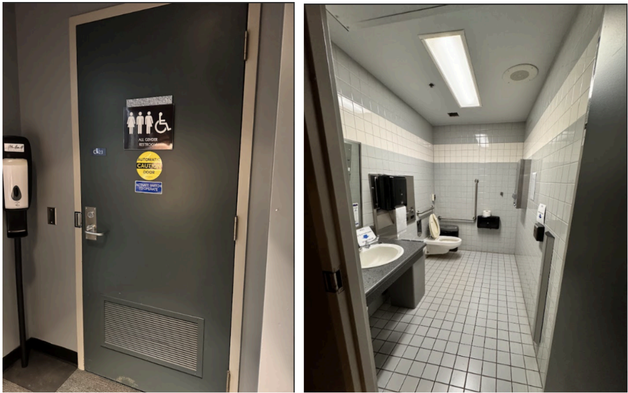
Figures 7-8: image of the accessible washroom in Glenn Gould Studio.