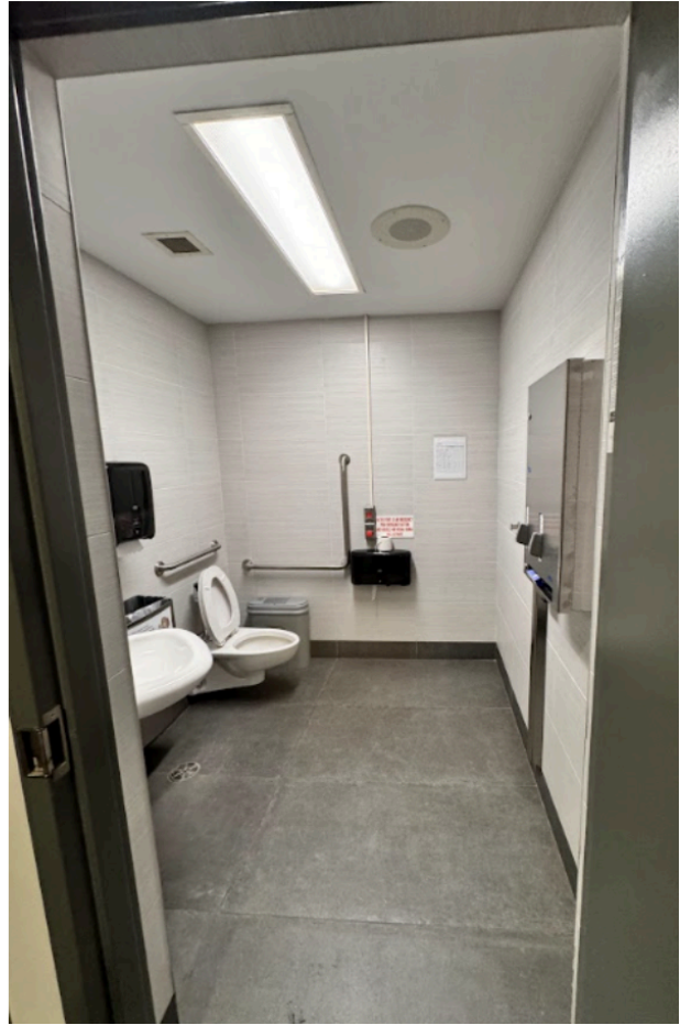
Figures 11-12: image of the accessible washroom in the CBC Conference Centre.