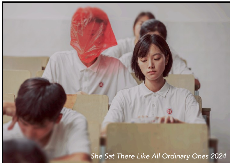
She Sat There Like All Ordinary Ones 2024