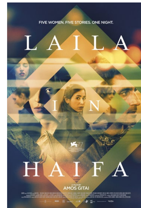
LAILA IN HAIFA by Amos Gitai