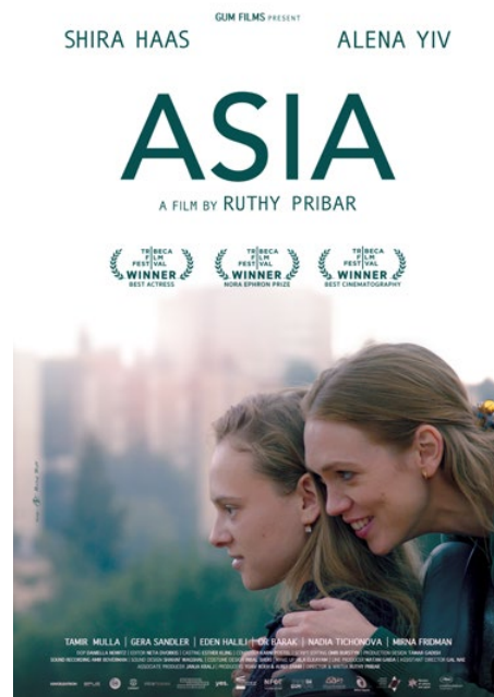
ASIA by Ruthy Pribar

The Israel Film Fund also supports and encourages international co-productions, in order to expand the scope of Israeli and global filmmaking relations.