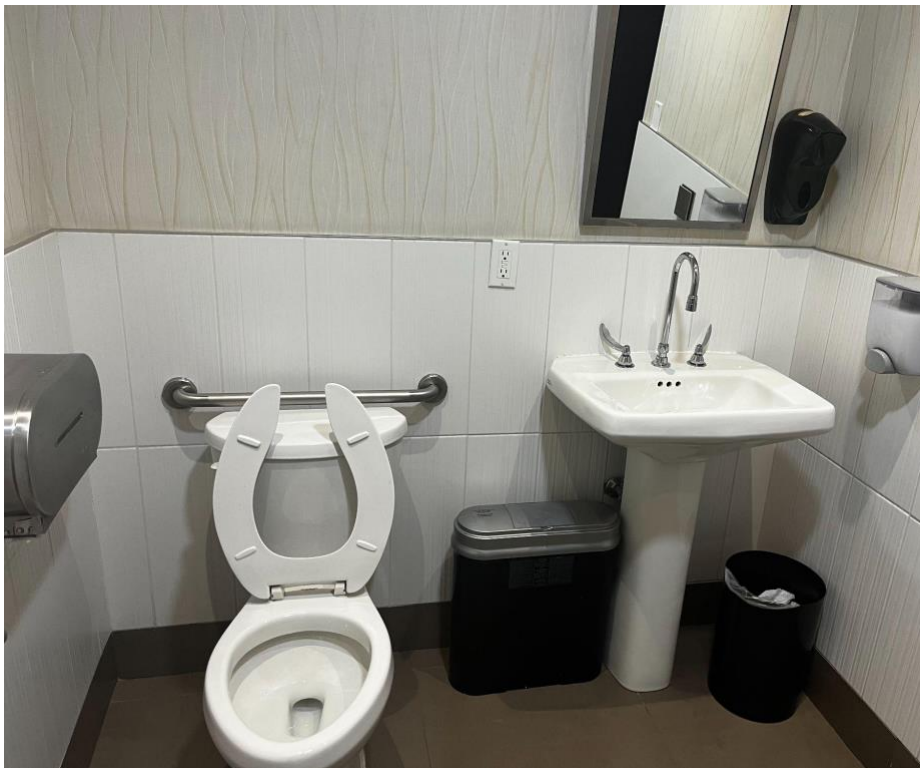
Figure 6: A photograph of the mezzanine accessible washroom at the Hyatt Regency.