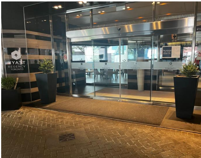
Figure 4: A photograph of the sliding door on Widmer St.