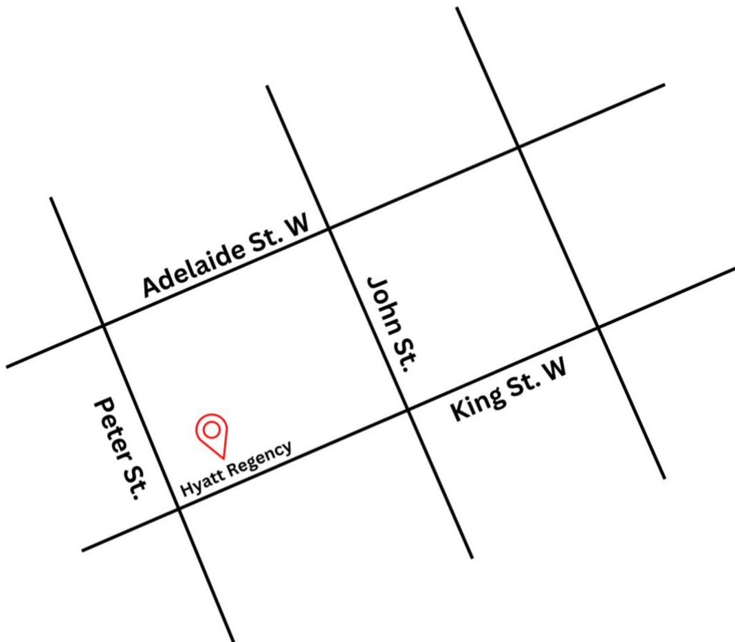
Figure 1: A map of downtown Toronto with the Hyatt Regency at King St. W. and Peter St., with Adelaide St. W. to the north