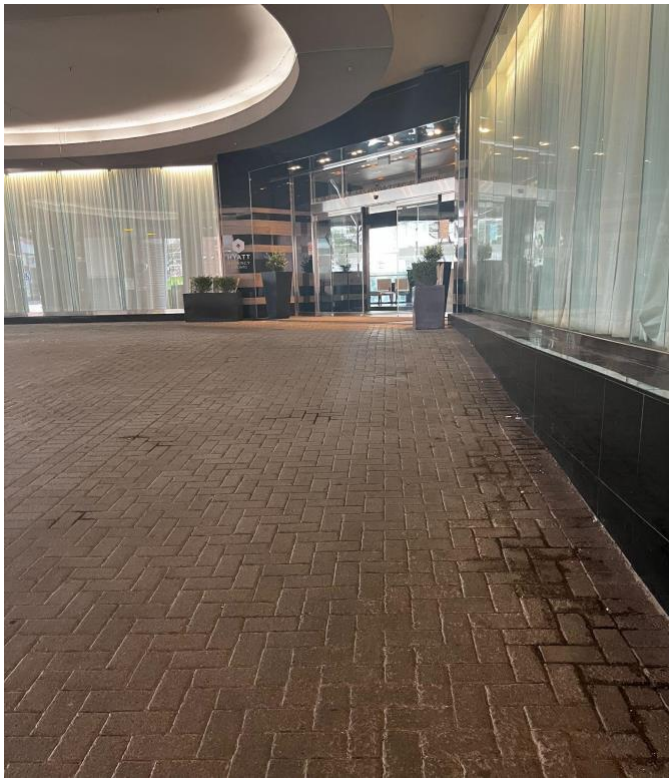
Figure 3: A photograph of the entrance ramp along Widmer St.