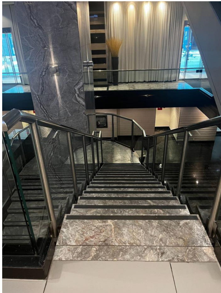
Figure 5: A photograph of stairs leading to the lower level.