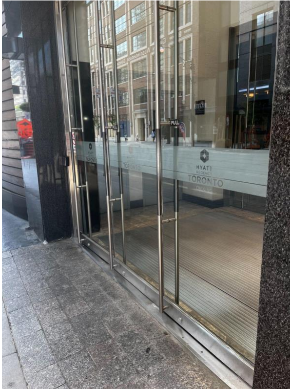
Figure 2: A photograph of the entrance along King St. W.