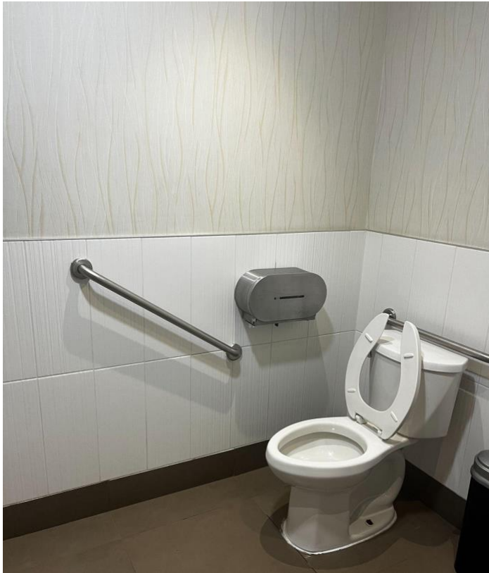
Figure 7: A photograph of the secondary angle of the mezzanine accessible washroom at the Hyatt. There is a toilet to the left and sink to the right