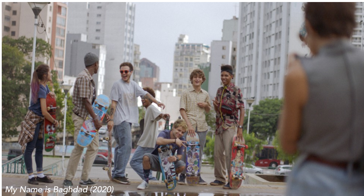
My Name is Baghdad (2020)

With the guidance of TIFF staff, the Committee is charged with planning some major teen-oriented events and digital engagements at TIFF Bell Lightbox, including the TIFF Next Wave Film Festival.