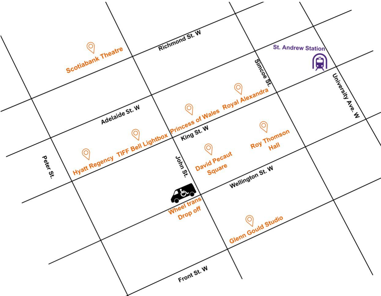
Figure 5: A Map of the venues where TIFF Festival Theatres, Studios, and Hotels are located. These include Scotiabank Theatre, Hyatt Regency, TIFF Bell Lightbox, Princess of Wales, Royal Alexandra, David Pecaut Square, Roy Thomson Hall, and Glenn Gould Studio.