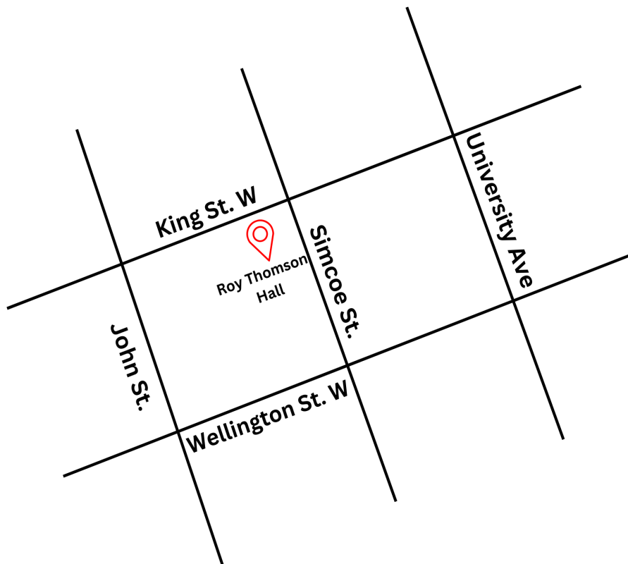
Figure 1: A Map of downtown Toronto with Roy Thomson Hall at King St. W. and Simcoe St., and John St. and Simcoe St. to the west and east, and Wellington St. W. to the south