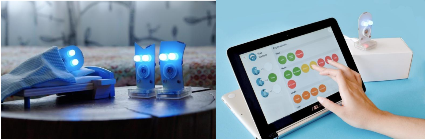
Coding Characters with Little Robot Friends, Little Robot Friends