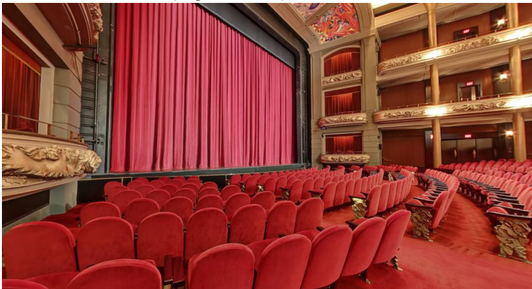
Figure 4: A photograph of the approximate view from Row GG 40–42