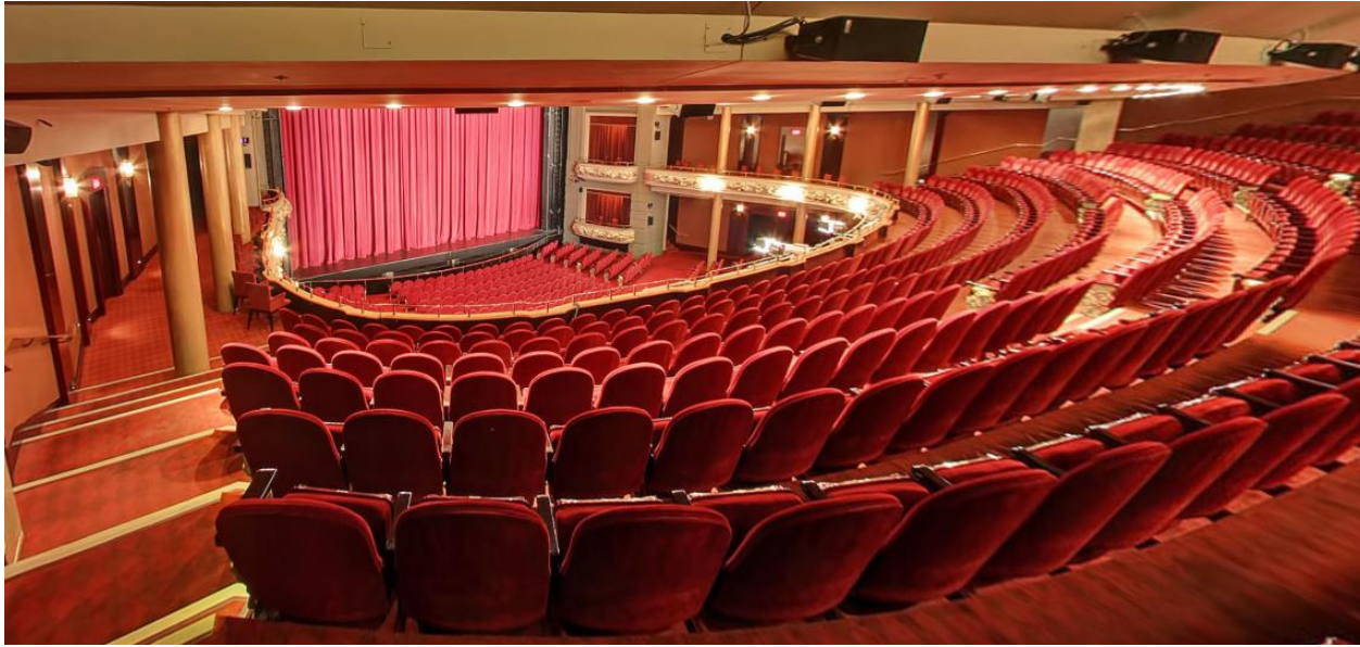
Figure 5: A photograph of the approximate view from dress circle Row K