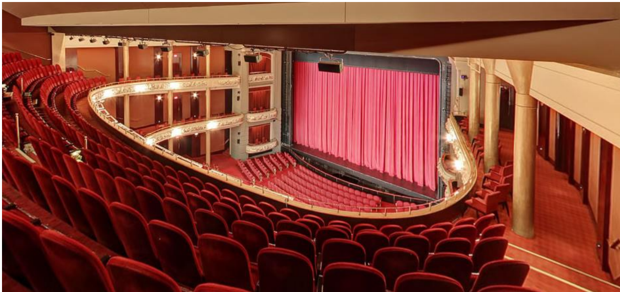
Figure 6: A photograph of the approximate view from Balcony row J