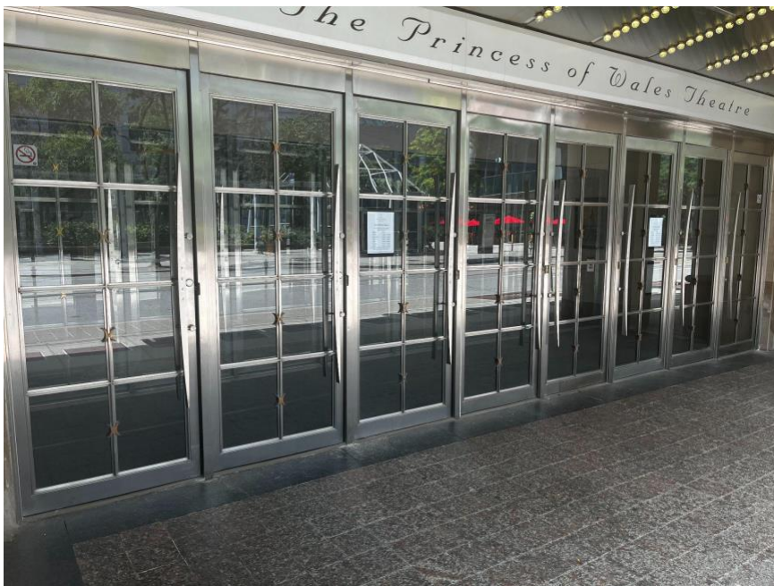
Figure 2: A photograph of the Front Doors to the Princess of Wales Theatre. There are Ushers who can assist in opening these doors.