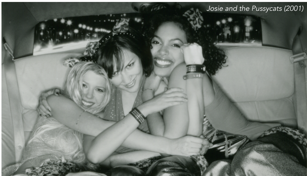
Josie and the Pussycats (2001)

The festival also featured a Growing Pains Movie Marathon, with timeless classics like Boy , Josie and the Pussycats , Love & Basketball , Step Up , and My Own Private Idaho .