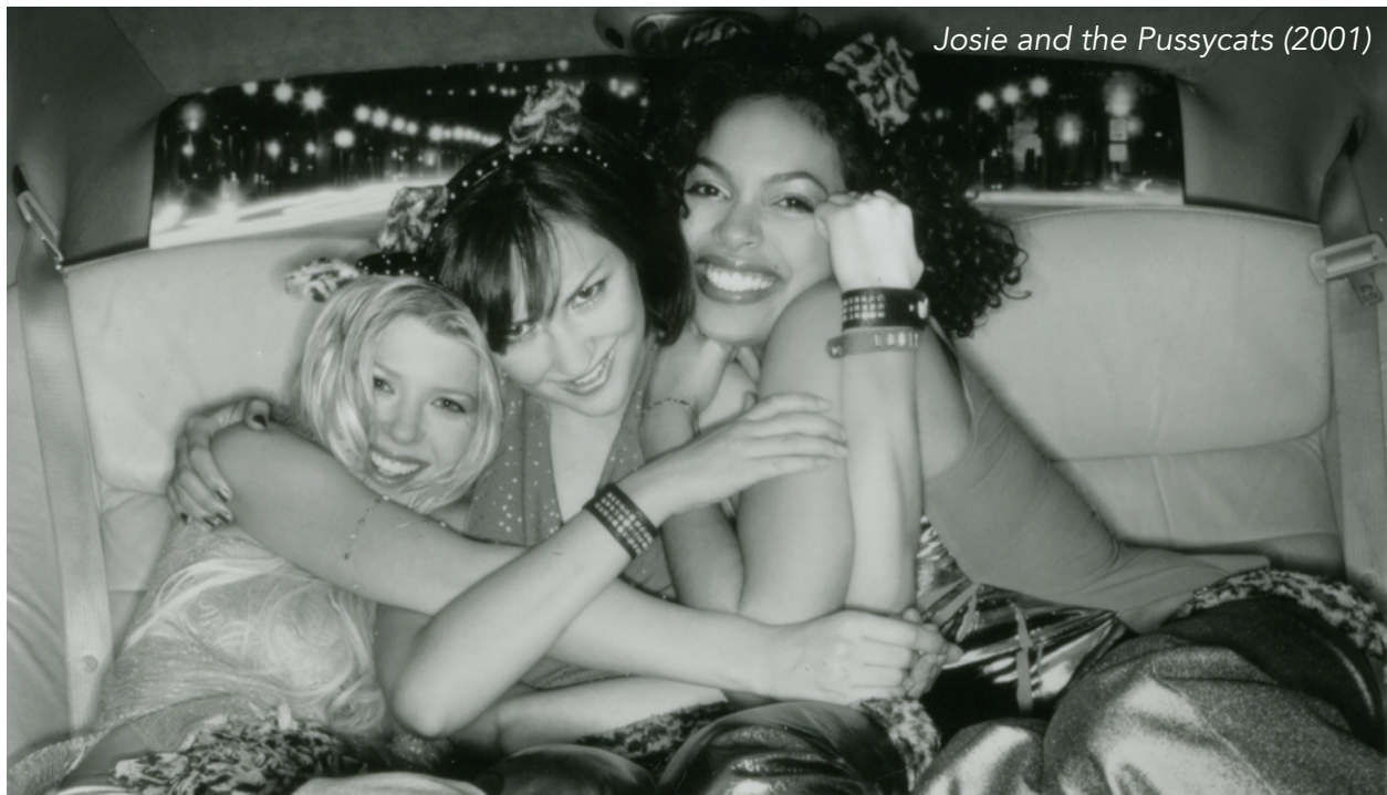
Josie and the Pussycats (2001)

The festival also featured a Growing Pains Movie Marathon, with timeless classics like Boy , Josie and the Pussycats , Love & Basketball , Step Up , and My Own Private Idaho .