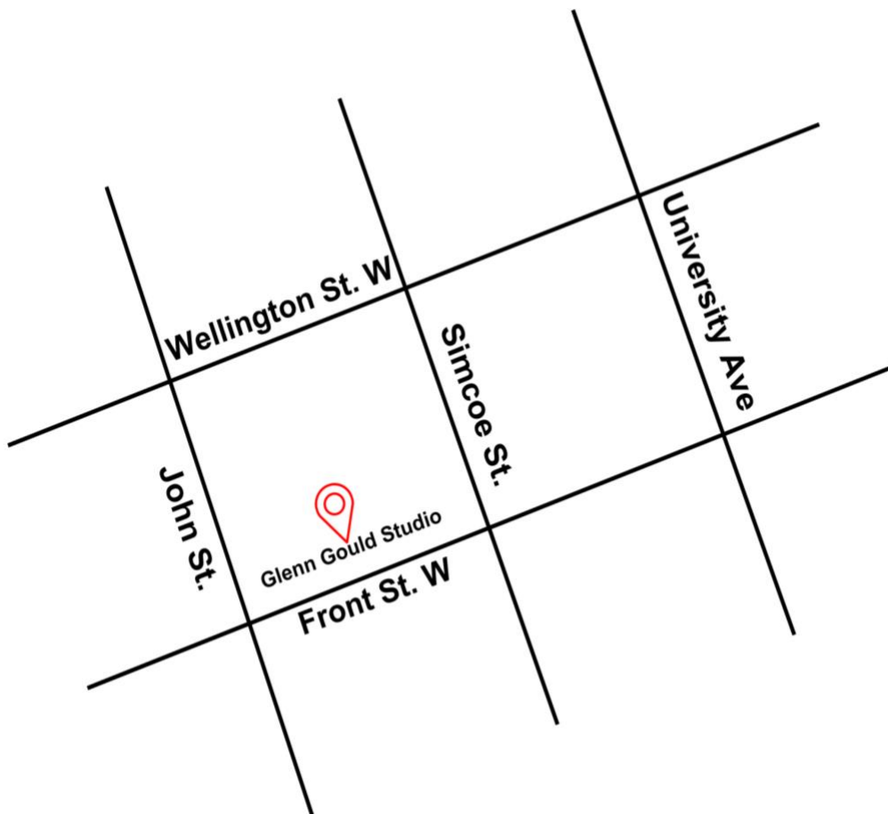
Figure 1: Map of downtown Toronto with Glenn Gould Studio at Front St. W. and John St., with Wellington St. W. to the North