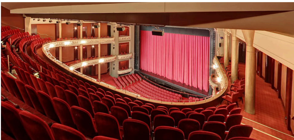
Figure 6: A photograph of the approximate view from Balcony row J