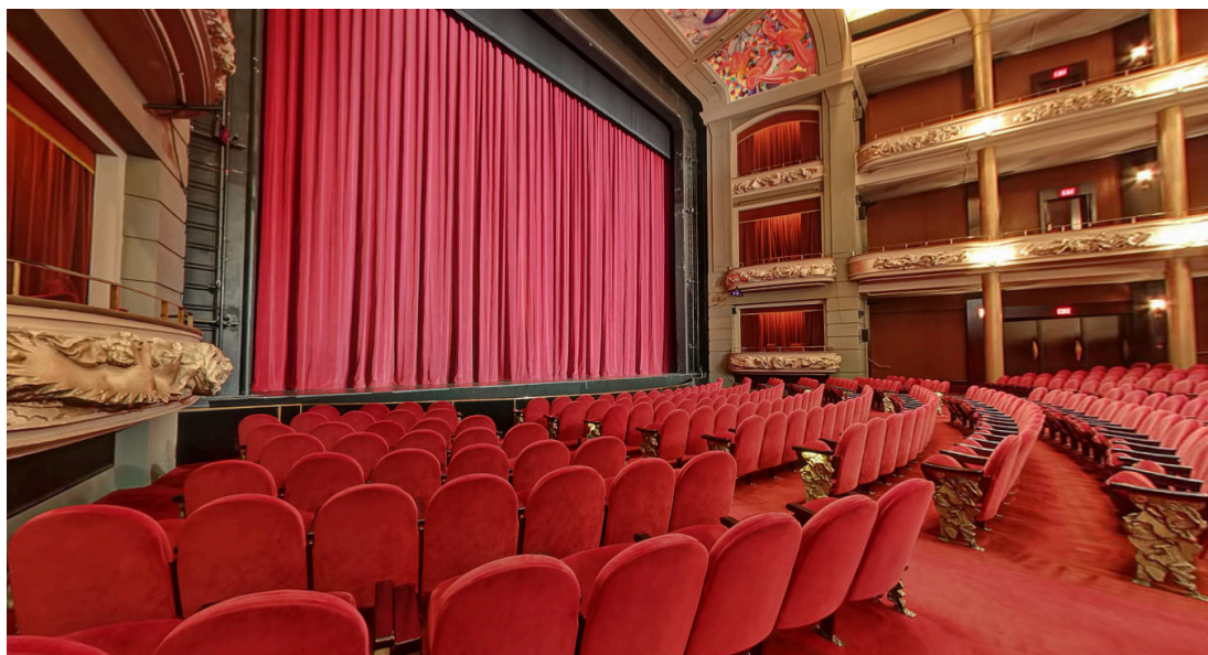
Figure 4: A photograph of the approximate view from Row GG 40–42