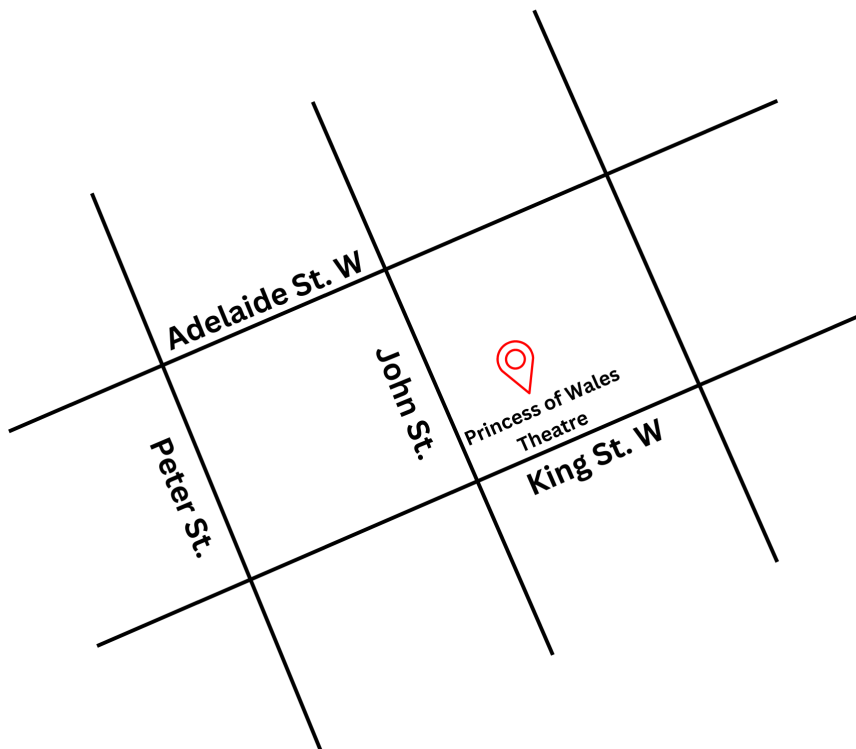
Figure 1: A Map of downtown Toronto with Princess of Wales at King St. W. and John St., and Adelaide St. W. and King St. W. to the north and south.