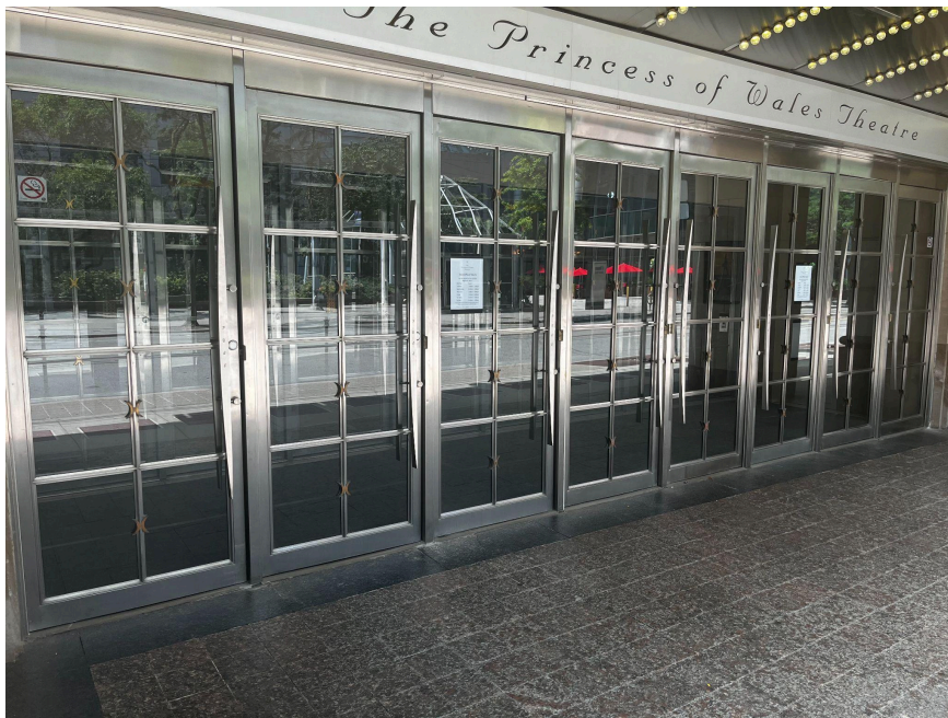
Figure 2: A photograph of the Front Doors to the Princess of Wales Theatre. There are Ushers who can assist in opening these doors.