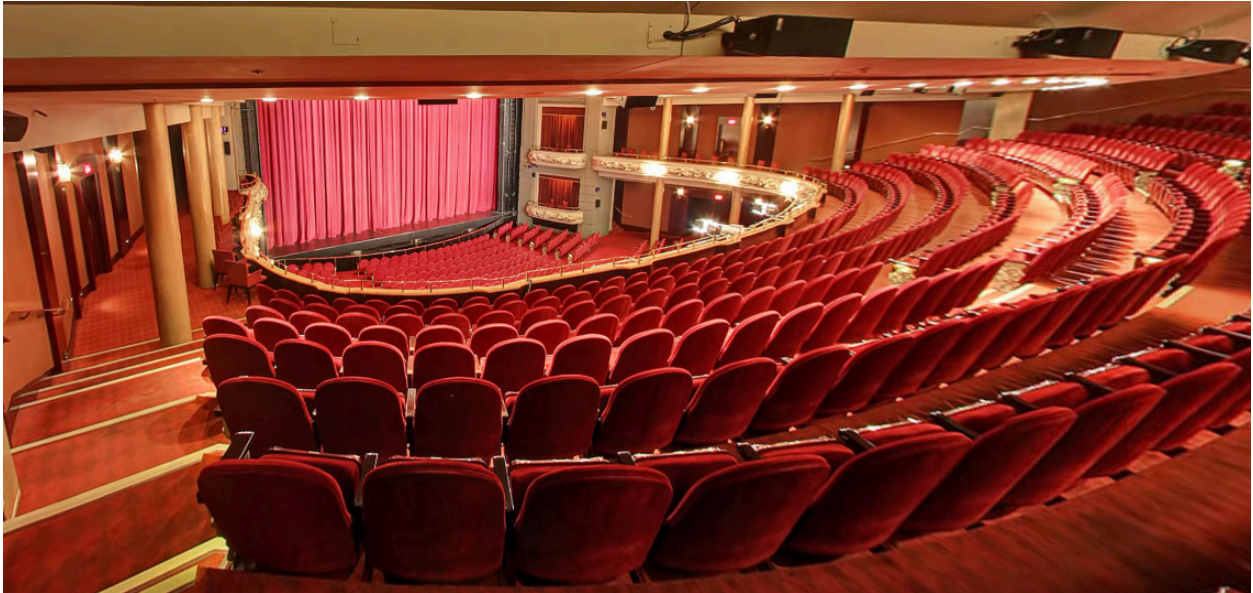
Figure 5: A photograph of the approximate view from dress circle Row K