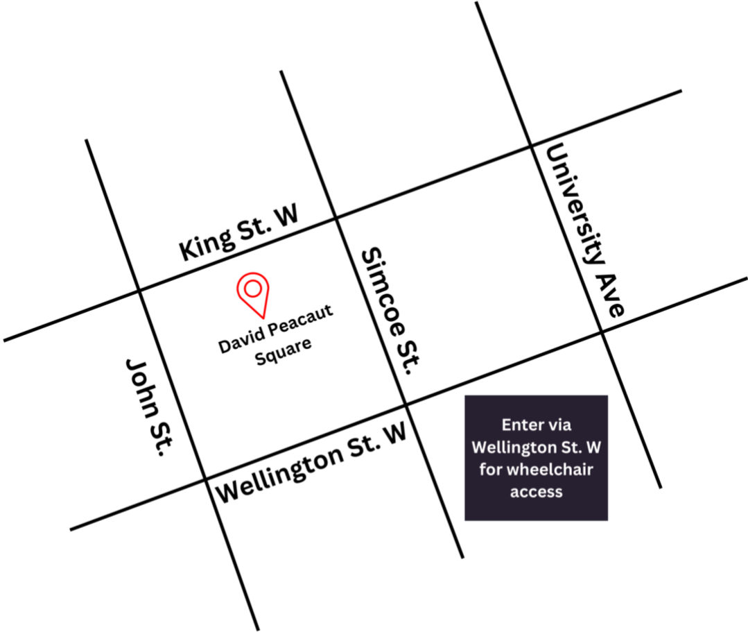
Figure 1: A Map of downtown Toronto with David Pecaut Square in between King St. W. and John St., and King St. W. and Simcoe St.