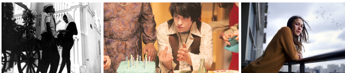
I Am Cuba (1964), C.R.A.Z.Y. (2005), Night Raiders (2021)

A month-long International Women's Day Celebration showcasing Nordic Women Filmmakers, a retrospective on director Joan Micklin Silver, and a spotlight on Natalie Wood; In Conversation With... Canadian filmmaker & author Sarah Polley; Jean-Marc Vallée tribute screening; the return of Books on Film and Canada's Top Ten shorts and features showcase