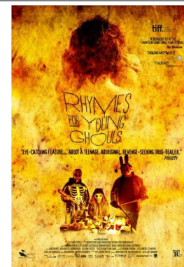
Rhymes for Young Ghouls (2013), dir. Jeff Barnaby [AV] [Film File]