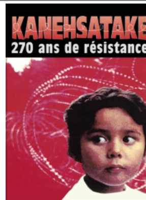
Kanehsatake: 270 Years of Resistance (1993), dir. Alanis Obomsawin [AV] [Film File]