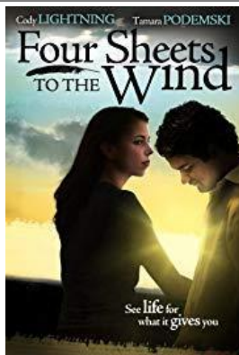
Four Sheets to the Wind (2007), dir. Sterlin Harjo [AV]