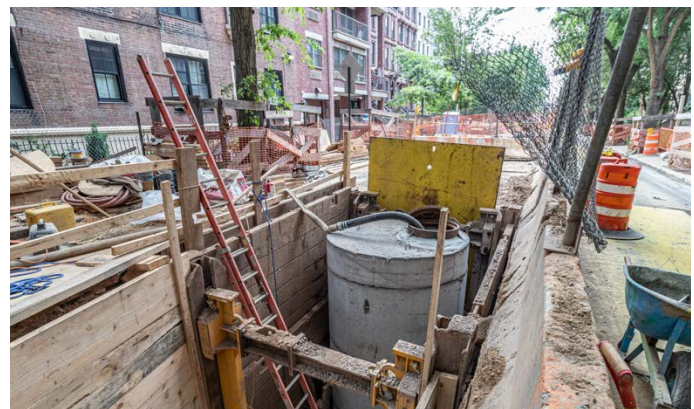
Installation of new manhole at Park Place