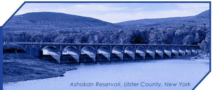
Ashokan Reservoir, Ulster County, New York

Most of New York City's drinking water flows from reservoirs as far as 125 miles north using only gravity!