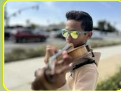
"We Beat Together" by Kaiden Surti