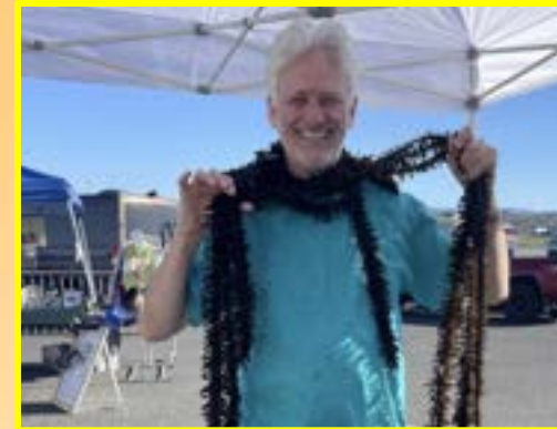
Could seaweed be the new kale?