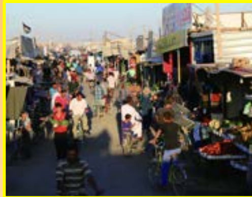
At the world's largest Syrian refugee camp, food still matters