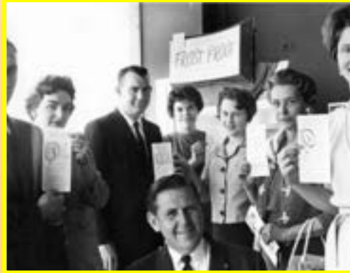
How refrigeration changed the way we eat