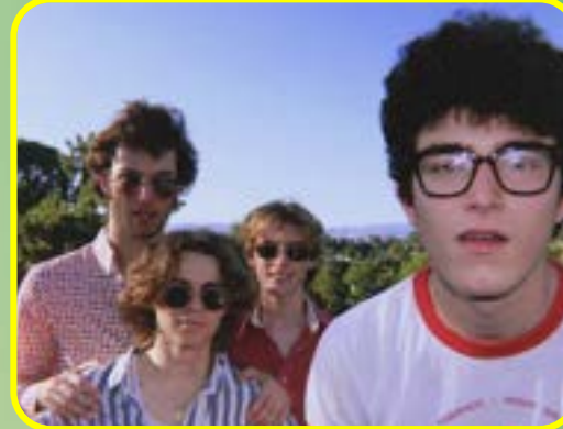
"Carbondale" by Great Big Cow