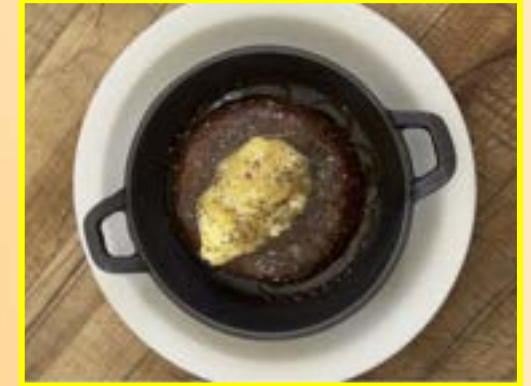
Dunsmoor's famous cornbread recipe