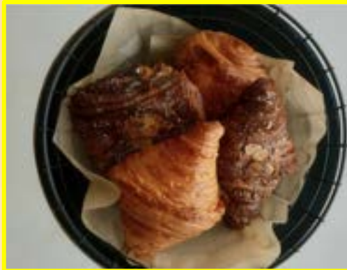
In the Weeds with Lou The French On The Block