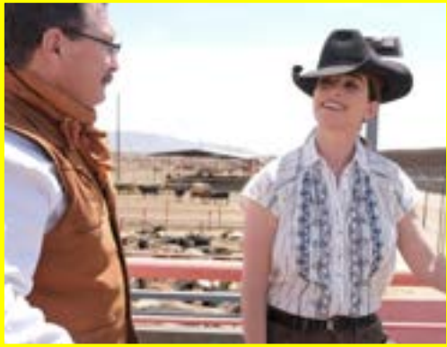
Pati Jinich - La Frontera