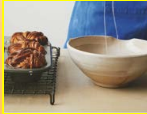
Want better bakes?