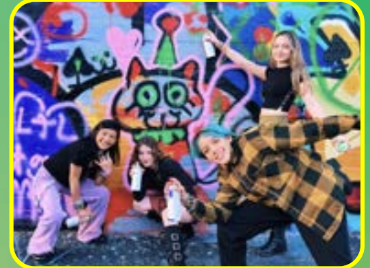
"By The Way" by Slideshow