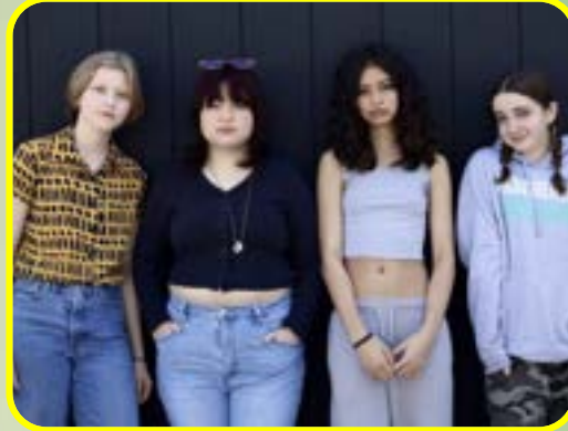
"Naive" by The Lemonfrogs

These creators were featured across KCRW channels including our website, social media, and radio broadcast. Plus, they got to perform LIVE at a special edition of School Night.