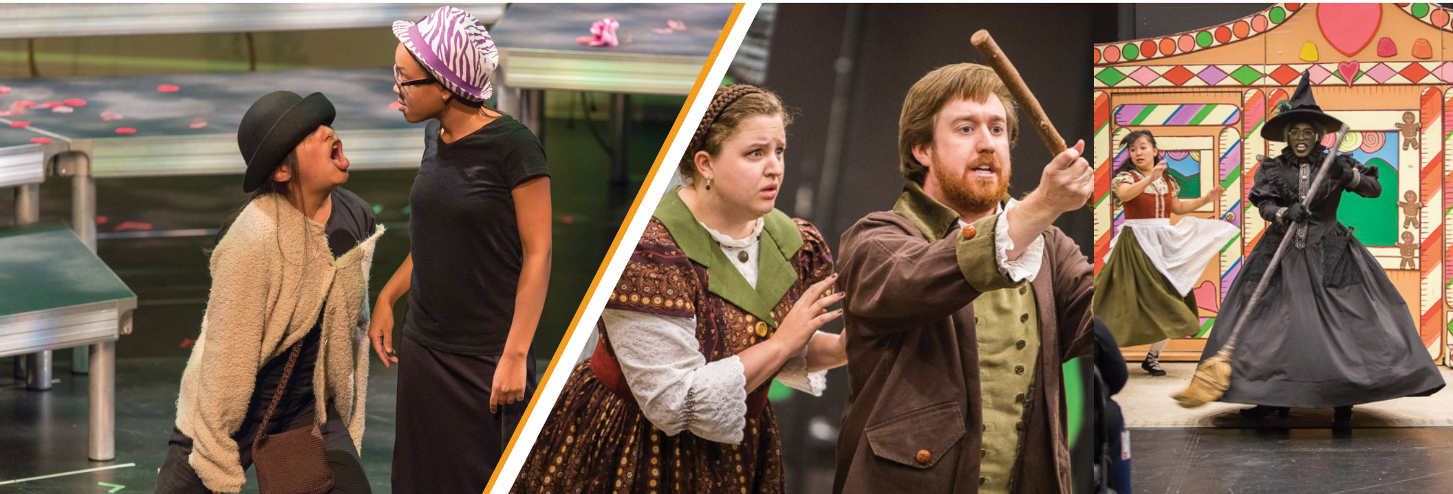
Portland Playhouse’s Fall Festival collaborates with local middle and high schools on an immersive theater skills training program that ends in a two-day performance festival (pictured left). Portland Opera to Go reaches 14,000 K-12 students each year, performing 50-minute versions of classic operas.