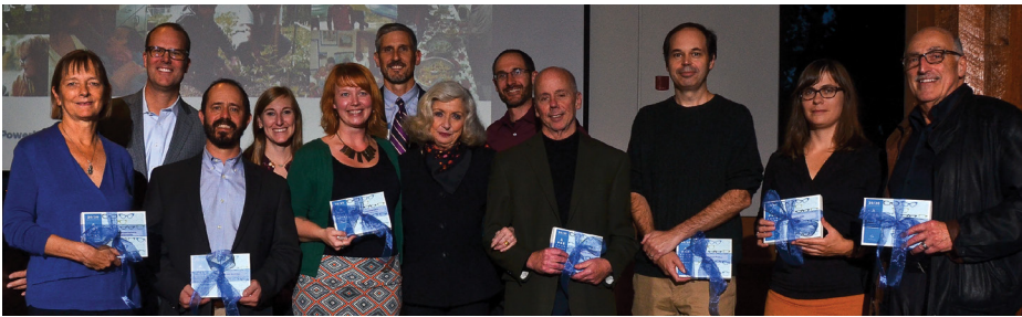
We're honored to support the efforts of eight organizations that are helping end homeless in our state.

In honor of our 20th anniversary of grant-giving, we awarded $235,000 to eight organizations that are working to end this crisis.