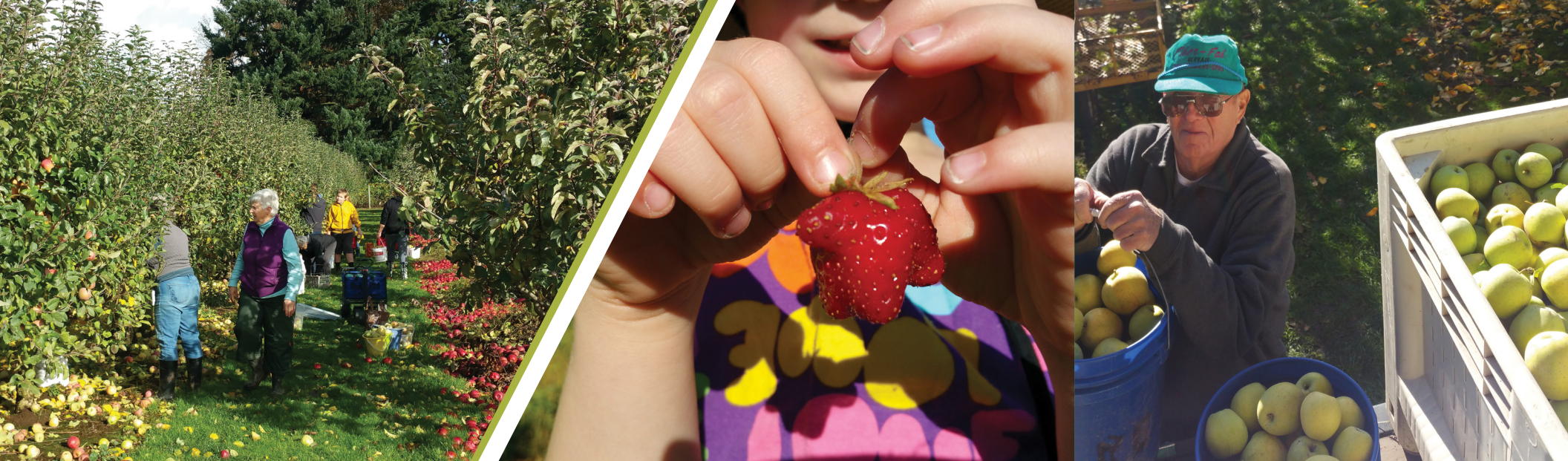
Salem Harvest and volunteer families pick a variety of fresh fruit and vegetables donated by local growers. Families harvesting together can foster a deeper connection to their food and Oregon agriculture.