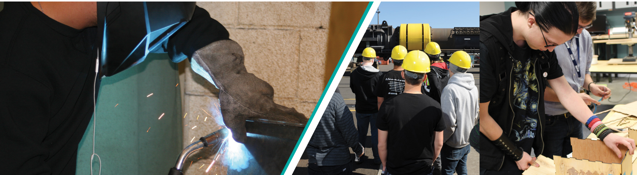
Impact NW's career exposure program, Pathways to Manufacturing, introduces students to manufacturing jobs and careers through hands-on training and industry site visits.