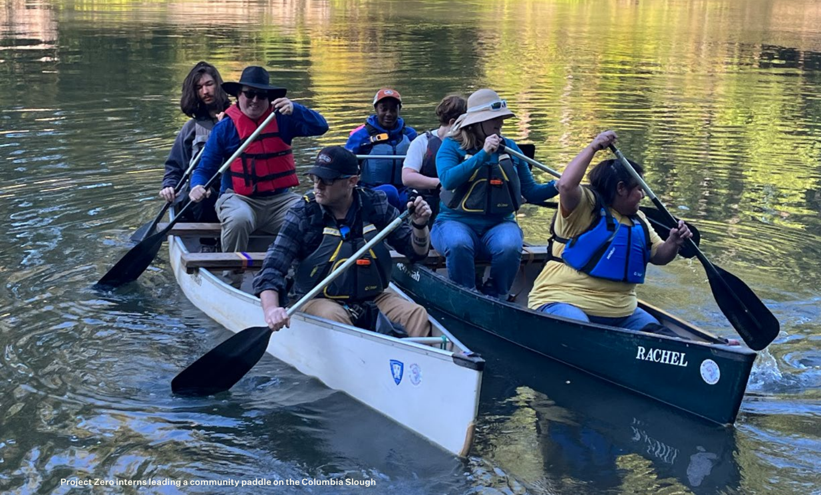
Project Zero interns leading a community paddle on the Columbia Slough