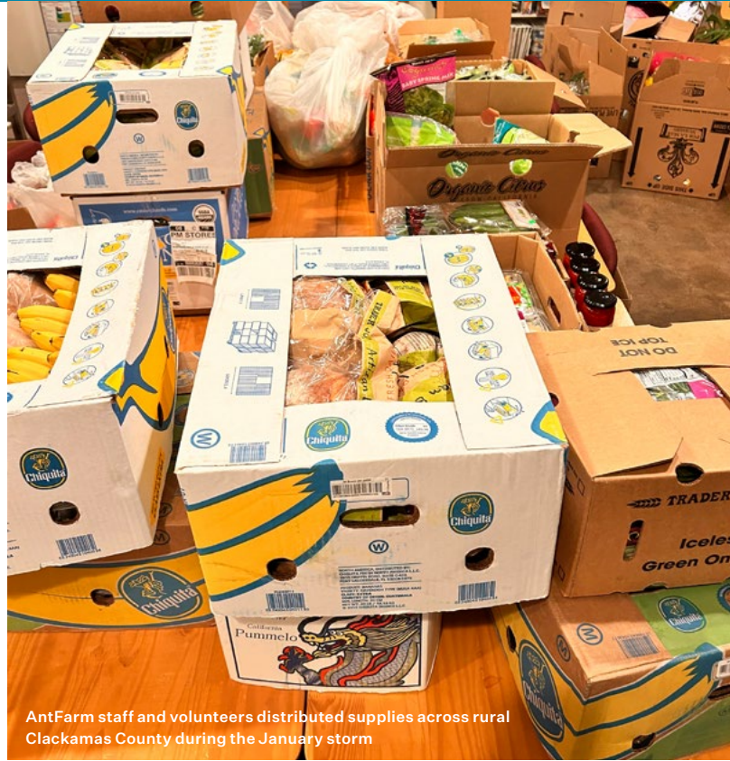
AntFarm staff and volunteers distributed supplies across rural Clackamas County during the January storm