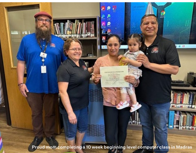
Proud mom completing a 10 week beginning level computer class in Madras

With tailored programs in English and computer proficiency, job readiness and small business support, participants build confidence and economic independence. Thanks to the Foundation's support, LCA is fostering prosperity in rural communities — helping families increase their incomes, start businesses, and secure sustainable careers for the future.