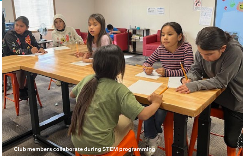
Club members collaborate during STEM programming

“Because of tremendous partnerships like this one, our kids are better equipped for academic success and are more prepared with the skills needed to enter the 21st century workforce. We are thankful to be able to help our Warm Springs youth achieve great futures.”