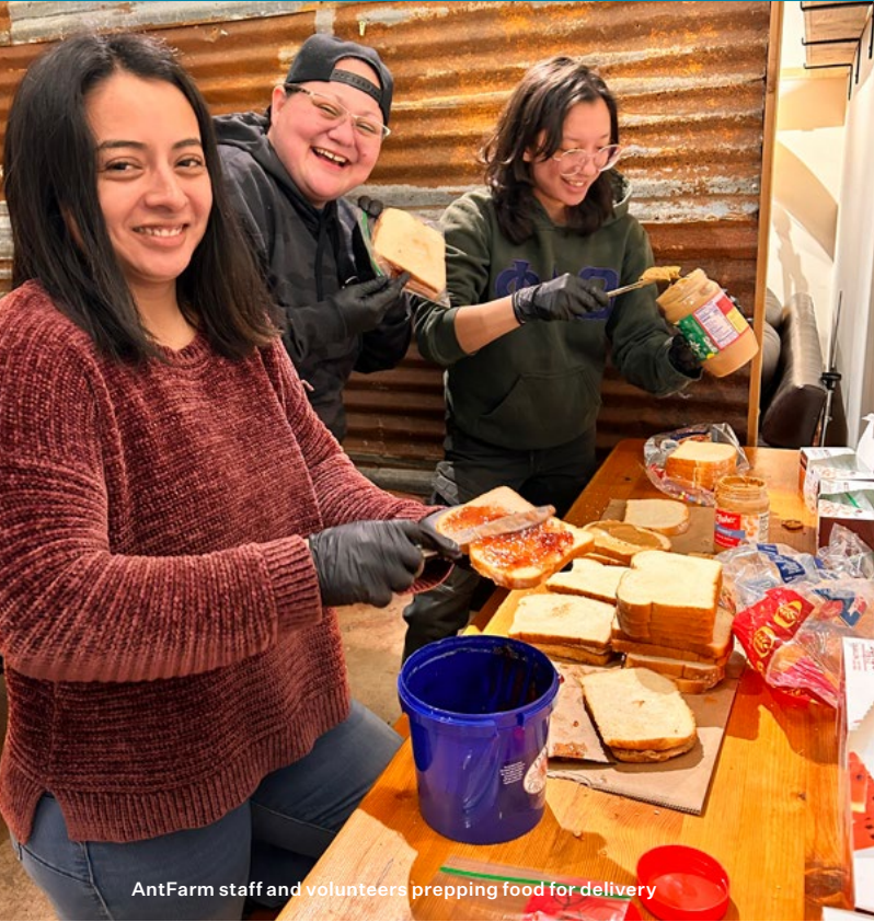
AntFarm staff and volunteers prepping food for delivery