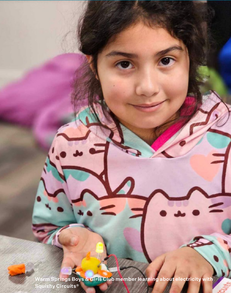
Warm Springs Boys & Girls Club member learning about electricity with Squishy Circuits®