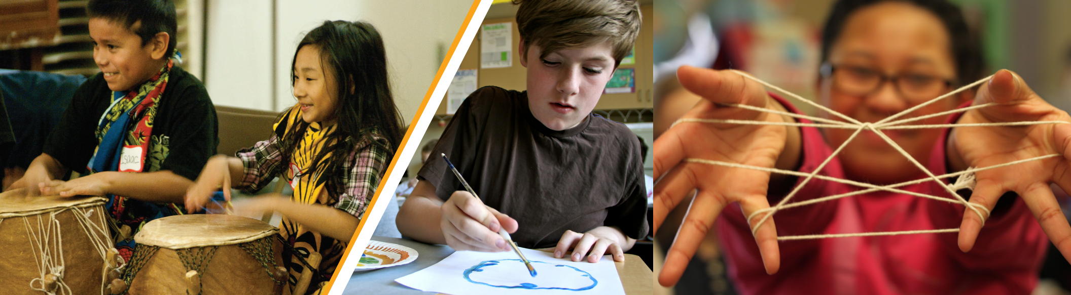
The Right Brain Initiative transforming learning through creative expression.