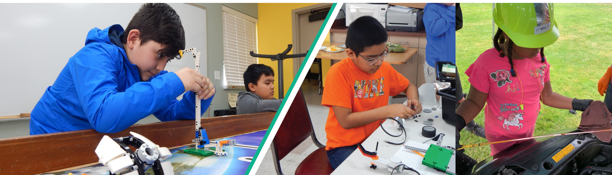
Left and center: STEM education in action at Centro Cultural, promoting personal growth and empowerment for Washington County youth. Right: A Girls Build builder in action!

Community 101 is the student leadership program created by the PGE Foundation in 1997 and now administered by the Oregon Community Foundation.