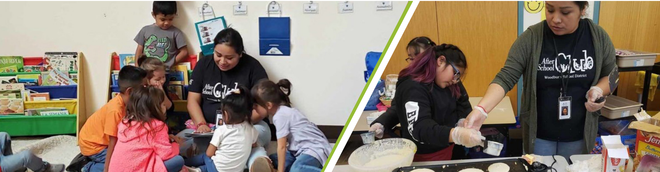
Farmworker Housing Development Corporation supports families and communities in Woodburn, Oregon.

30% OF DOLLARS GRANTED TO ARTS AND CULTURE PROGRAMS SERVE RURAL COMMUNITIES