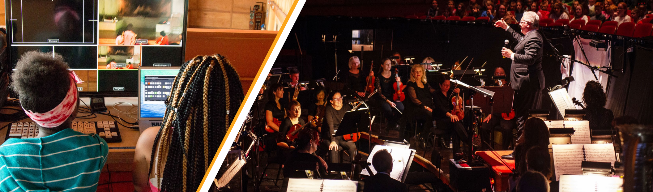
Left: Caldera arts youth program, inspiring creative expression through technology. Right: Oregon Ballet Theatre School Performance Series, the music behind the dance.