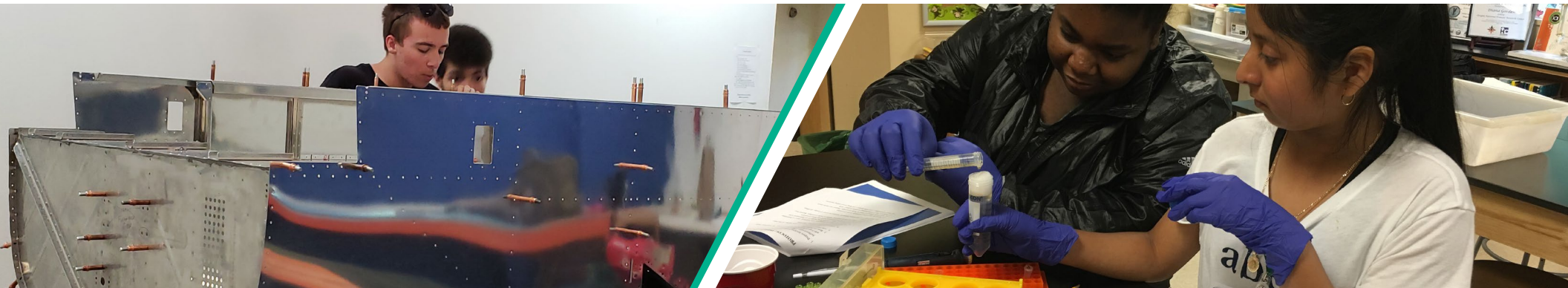
Left: Airway Science for Kids, creating equity through aviation STEM education. Right: On Track OHSU!, inspiring that "aha" moment for a new, diverse generation of health science professionals.