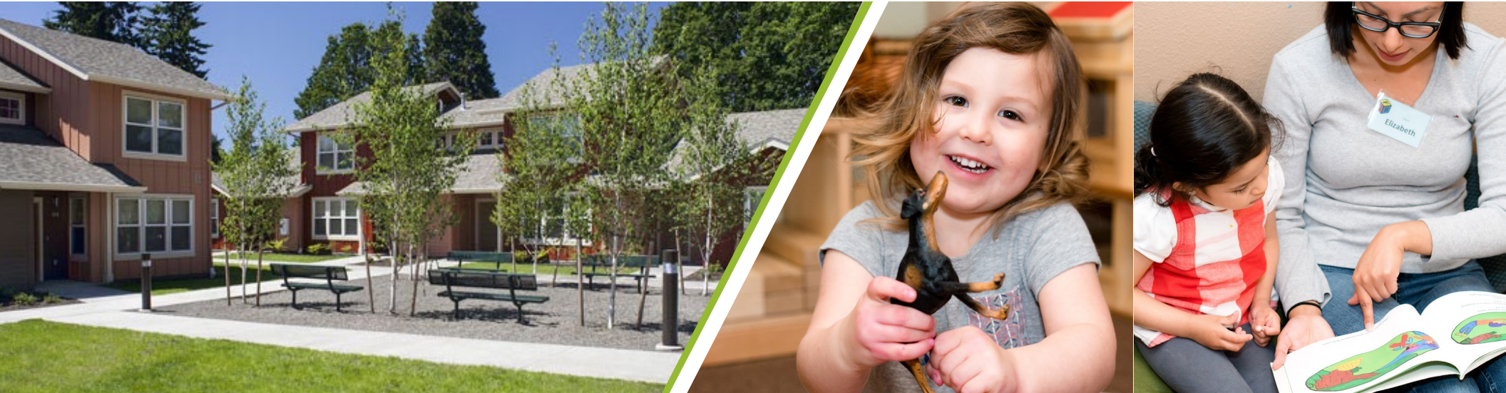
Left: Bienestar, building housing, hope and futures through its develop and preserve affordable housing project. Right: Family Building Blocks therapeutic classroom, keeping children safe and families together.

Ethos Japanese Garden Society of Oregon Miracle Theatre Group Northwest Film Center Oregon College of Art and Craft Oregon East Symphony Portland Willesden Read WorldOregon Write Around Portland