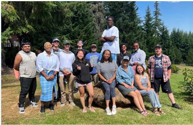
2022 Project Zero interns at Equity Day at Timothy Lake.