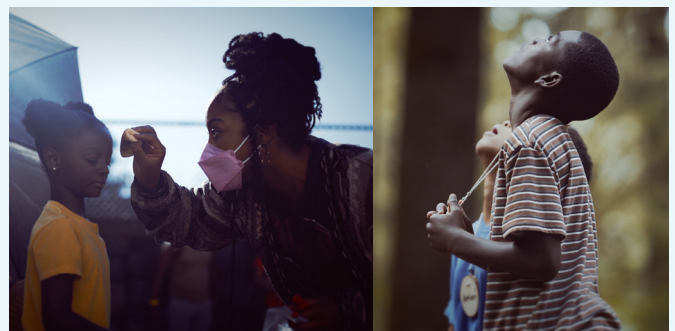
Behind the scenes footage during the making of Outdoor School: The Movie .

Click here to watch the Outdoor School movie trailer