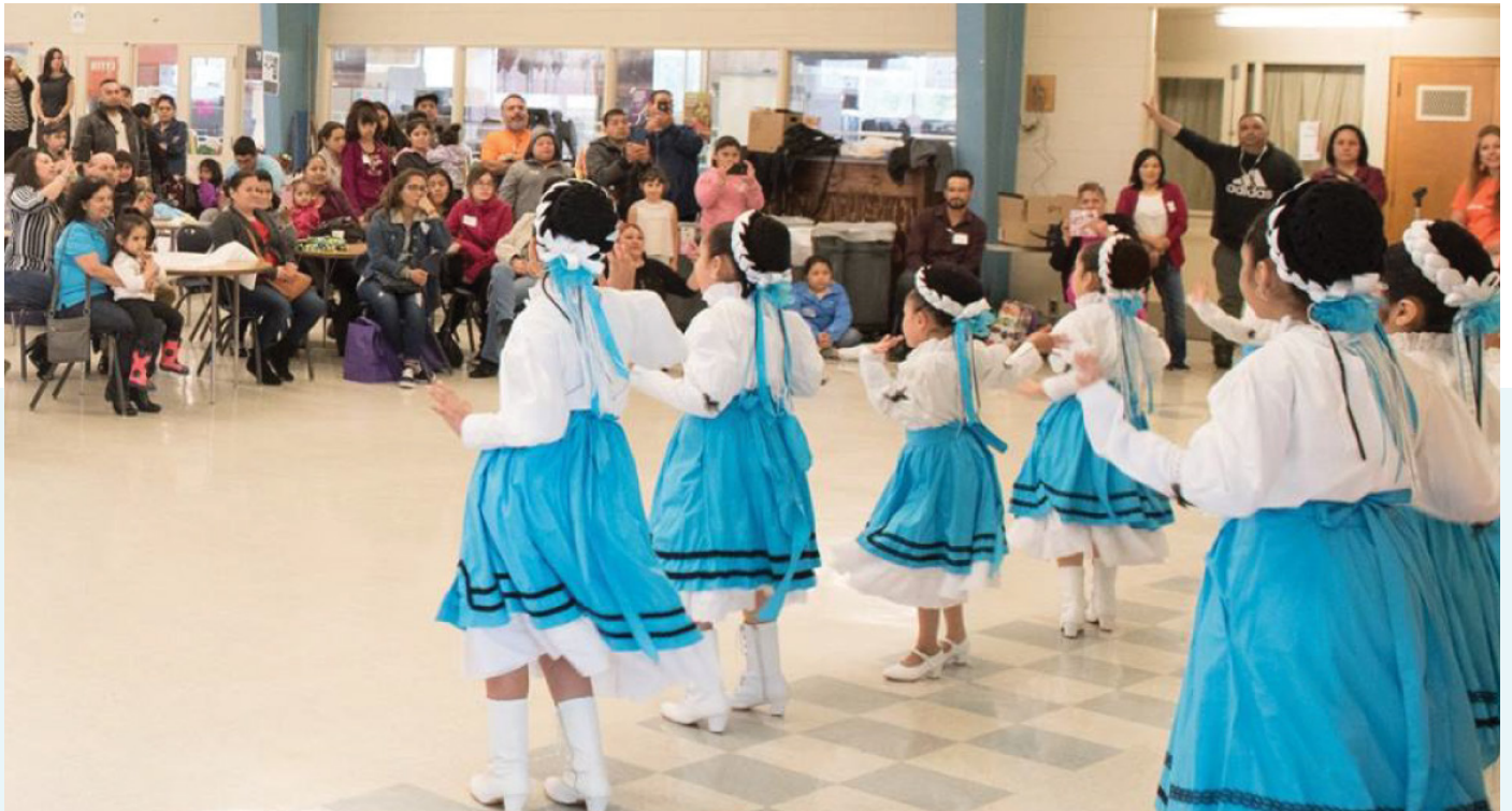
Latino Network community event.