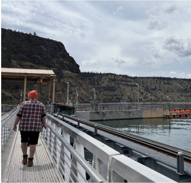
Project Zero intern touring the PGE Pelton Round Butte Dam, a Destination Employer.