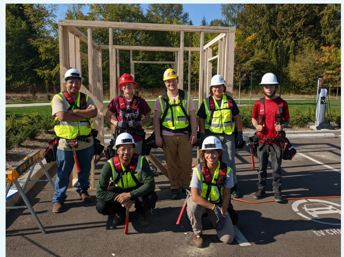
Portland YouthBuilders participants completing their vocational training.