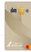
ila Gulf Air