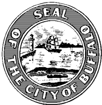
Byron W. Brown Mayor

65 Niagara Sq Rm. 301 Buffalo, NY 14202 (716)851-4078