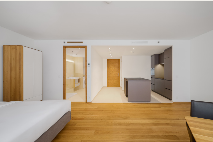
Living & Kitchen