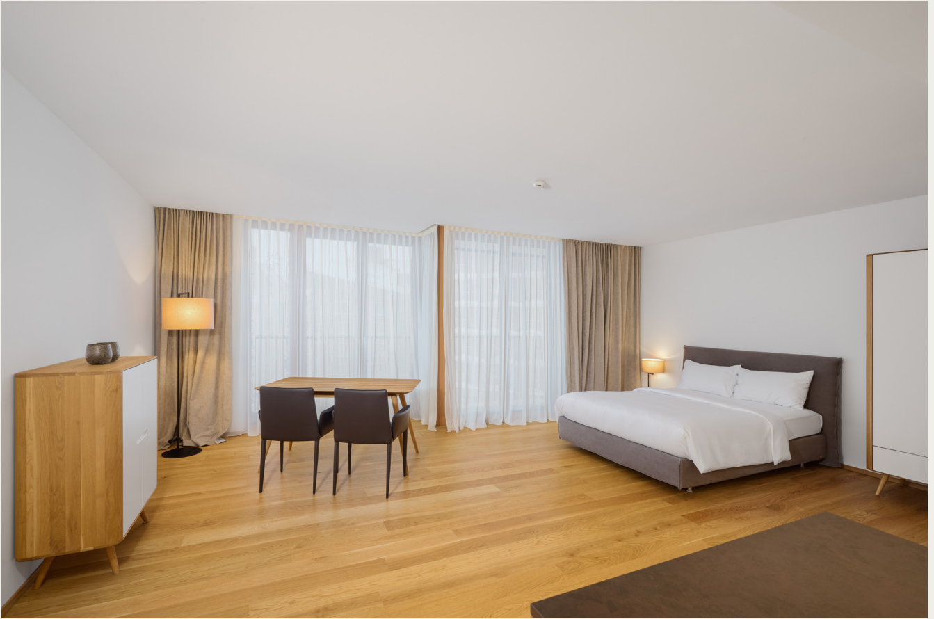
Living & Dining