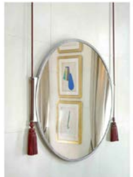
French monumental Mirror, circa 1930 silver-plated bronze, mirrored glass, silk tassels Estimate: 8,000 - 12,000 USD Lot 192