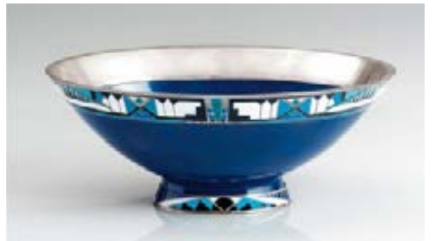
A coupe by Gustave Miklos, 1921, blue agate, enamel, (from the Jacques Doucet collection) Estimate: 80,000 - 120,000 USD Lot 25