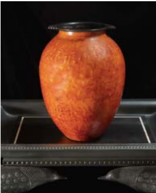
A 'Collarette' vase by Jean Dunand, circa 1925 lacquered metal, with original copper liner signed Estimate: 60,000 - 80,000 USD Lot 9

This astonishing sale will be divided between an evening auction presenting a curated selection and a day sale the following day. The first will comprise an important and unique six-panel screen by Eileen Gray, a rare Oiseaux low table by Armand-Albert Rateau and L'Homme et son Destin by Gustave Miklos. Although most of us will not get to see it in person the digital catalogue put together by the Sotheby's team (and available online) conveys in a beautiful way the magnificent geometries and texture of these magnificent works.