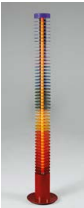
'Iride' Floor Lamp by Ico Parisi, circa 1970 manufactured by Lamperti painted aluminum, painted metal Estimate: 10,000 - 15,000 USD Lot 128