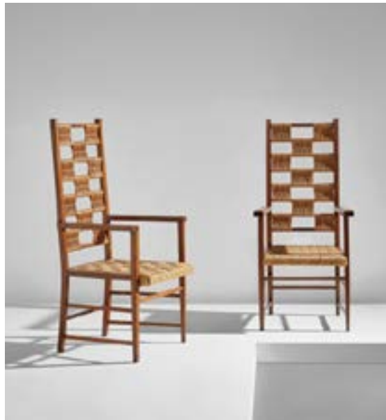
A pair of armchairs by Koloman Moser, circa 1903 oak, rush. Executed by Prag-Rudni- ker Korbwarenfabrik Estimate: 25,000 - 35,000 USD Lot 137