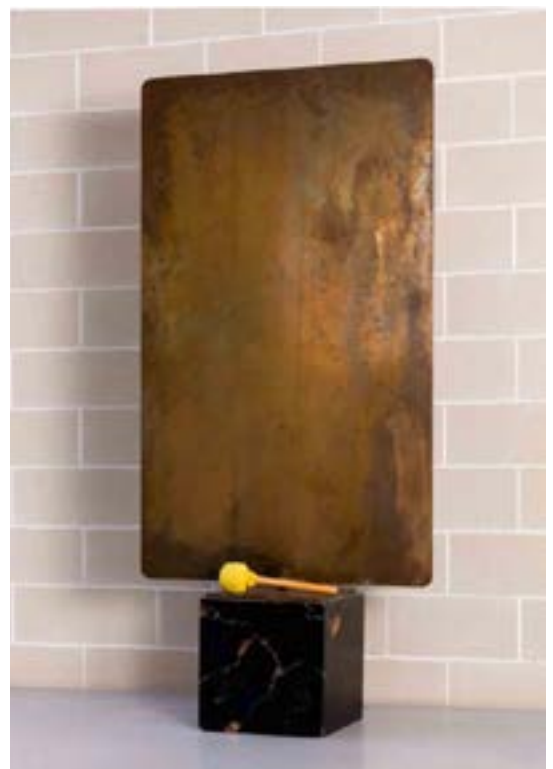
Untitled (Gong) by Harry Bertoia, 1972 Estimate: 50,000 - 70,000 USD Lot 375