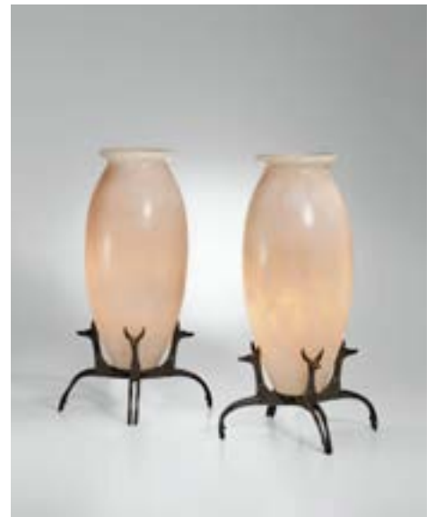
A pair of 'Fennecs' table lamps by Armand Albert Rateau, circa 1919-1920 patinated bronze, alabaster stamped Estimate: 200,000 - 300,000 USD Lot 40