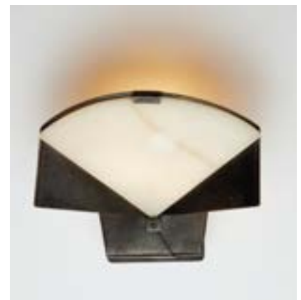
A Rare Sconce by Pierre Chareau, circa 1920 patinated iron, alabaster Estimate: 30,000 - 50,000 USD Lot 49