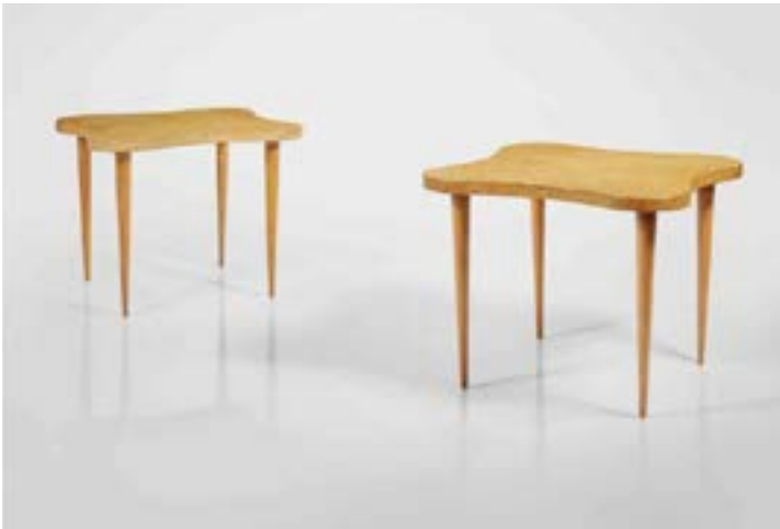
A Pair of Important Side Tables by Paul T. Frankl, circa 1945 cork, maple Estimate: 15,000 - 20,000 USD Lot 354