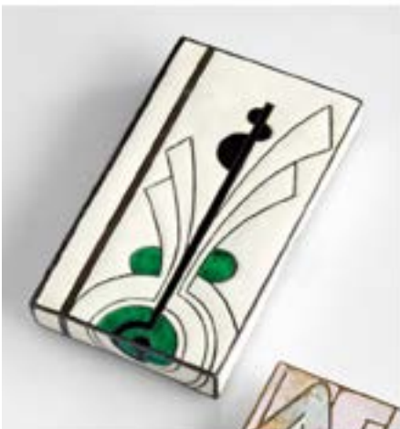
Cigarette Case by Jean Goulden, 1929 silver, champlevé enamel Estimate: 15,000 - 20,000 USD Lot 14