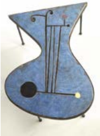
An Important and Unique Low Table by André Borderie, Véra Szekely and Pierre Szekely, circa 1955, commissioned by Henri Salvador glazed earthenware, painted metal Estimate: 40,000 - 60,000 USD Lot 382