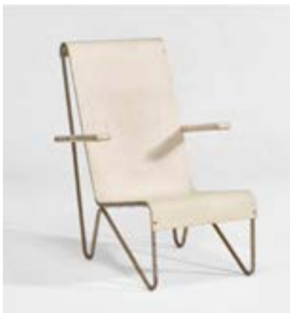
Early tube-frames 'Beugelstoel' by Gerrit Rietvel, 1927 Estimate $25,000 - $ 35,000