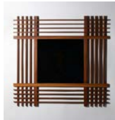
Important ash mirror by Ettore Sottsass, circa 1959 Estimate 15 000 - 20 000 € sold 23 400 €

Seeing your future acquisition remains a must for the collector who buys at auction. With the complications to travel it has become less and less convenient to come person but this frenetic acquisition wave only gives more reasons to be caution about condition and authenticity.