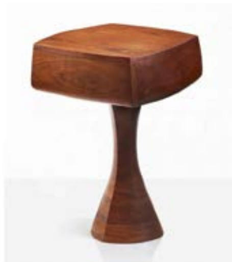
Desk by Wendell Castle, 1964 Estimate $25-$35,000