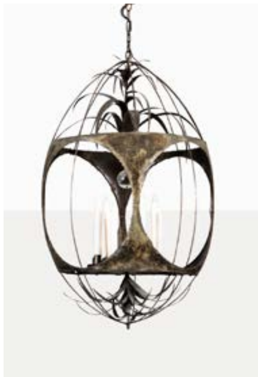
“Aquarium” lamp by Maison Desny, circa 1928 Estimate 7,000 € - 10,000 € A unique ceiling light by Claude and François-Xavier Lalanne, 1965 Estimate 240,000 € - 360,000 €