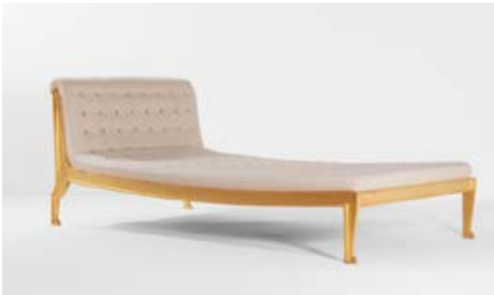
'Égyptien' Daybed by Marc du Plantier , circa 1935 Estimate $100,000 - $150,000