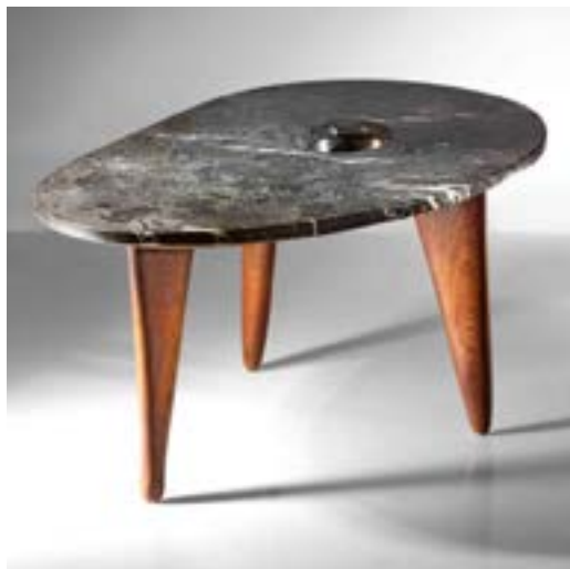
An Important Table by Isamu Noguchi, 1945-1947 Estimate $700,000 - $1,000,000