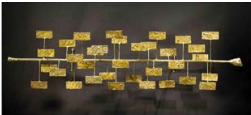
Multi-Plane Construction by Harry Bertoia, circa 1955 84 1/2 x 21 1/8 x 15 3/4 in. (213.3 x 55.8 x 40.6 cm) Estimate $80-$120,000