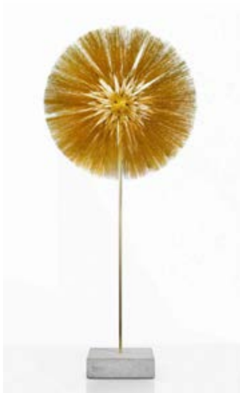
Dandelion by Harry Bertoia, 1965 77 3/4 in. (197.4 cm) high 32 1/4 in. (81.9 cm) diameter Estimate $200-$300,000