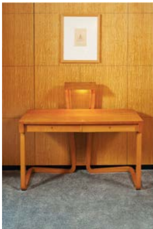
Illuminated Desk by Jean Royère, circa 1950 Estimate $50,000 - $70,000

Assembled in the 1990s (mostly through the DeLorenzo gallery) this collection includes iconic works by Jean Royère such as a 'Polar Bear' Sofa and an 'Antibes' Floor Lamp and a stunning selection of Vautrin mirrors. There are also less seen designs by the French designer such as the 'Eiffel' lamp and the illuminated desk that still move by their elegance and timeless qualities. Jean Royère's drawings are an insight into the attention to details and the care with which the designer created furniture or interiors. The estimates are overall conservative but the collection of such iconic and desirable works should do very well.