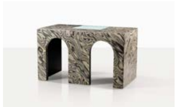
“Litta” desk by Ettore Sottsass, 1989 Manufactured by Zanotta, Milano, Italy Estimate 5,000 € - 7,000 €