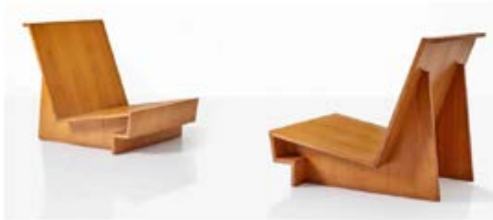
Pair of 'Usonian' chairs by Frank Lloyd Wright, circa 1939 estimate $15,000 - $20,000