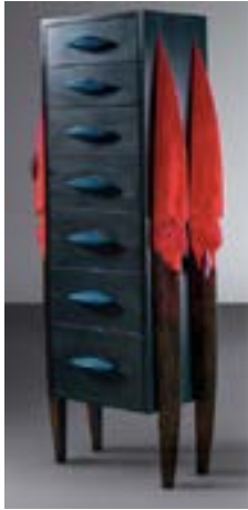
Cowabunga II cabinet by Wendy Maruyama, 1990 Estimate $2,000 - $4,000 Sold for $6,250

Another slice of the market to keep your eye on is the American Studio Craft. This movement of the late 20th century, not as well known in Europe, is a delightful balance between formal irreverence, technical mastery of traditional craft traditions as well as function and practicality. Resonating with the market coined as 'collectible design' the Chicago auction house Hindman auctioned the Springborn Collection of Contemporary Craft auction offering a beautiful selection.