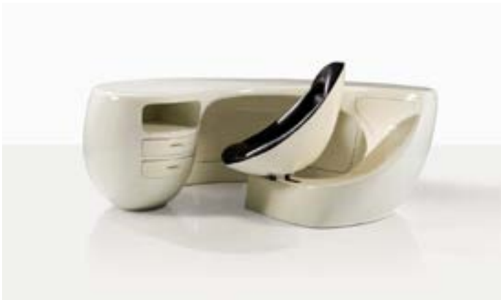
Boomerang Grand PDG desk by Maurice Calka, designed in 1969 Estimate 30,000 € - 50,000 €