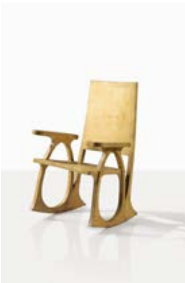
A rocking chair by Carlo Bugatti,- circa 1905 Estimate 8,000 € - 12,000 €