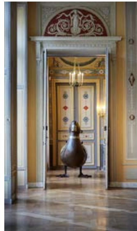
Le Grand Canard by François-Xavier Lalanne

The works presented were certainly beautiful but there were not all the most desirable of their kind. What does it mean for the market of these designers? Probably a little push but most likely a moment and a provenance to remember. What is certain is the collectors appetite for high end popular designers (the favourite being Lalanne, Giacometti and Royère) is driving the prices increasingly high.