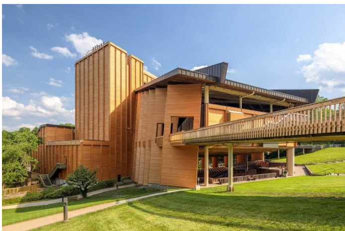
Exterior: SaferWood with Thermex-FR, Douglas Fir, Siding Project: The Filene Center, Wolf Trap, VA (2021), 500,000 BF