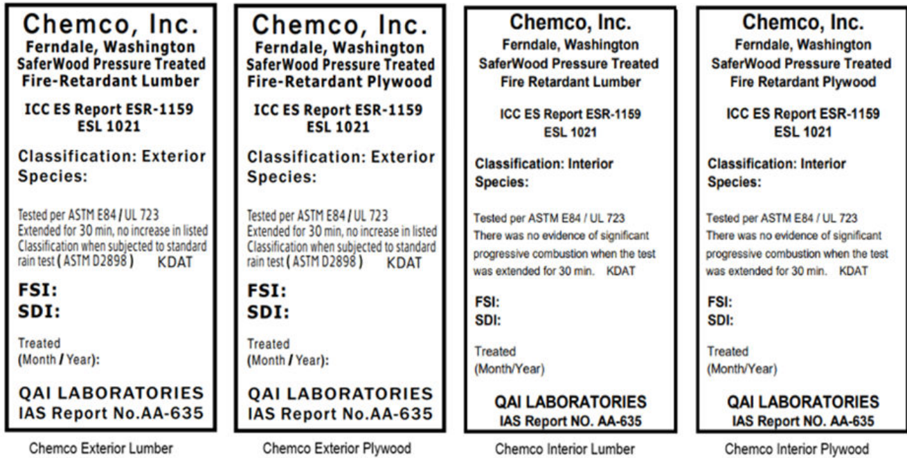
FIGURE 1—TYPICAL LABELS FOR SAFERWOOD-FX, THERMEX-FR AND FRX FIRE-RETARDANT LUMBER AND PLYWOOD