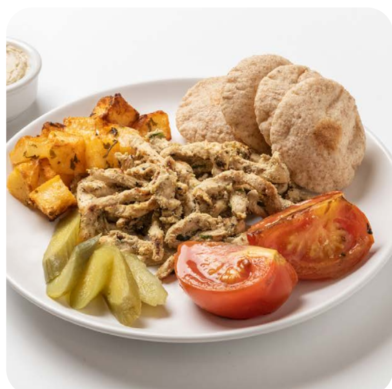
Chicken Shawarma Platter