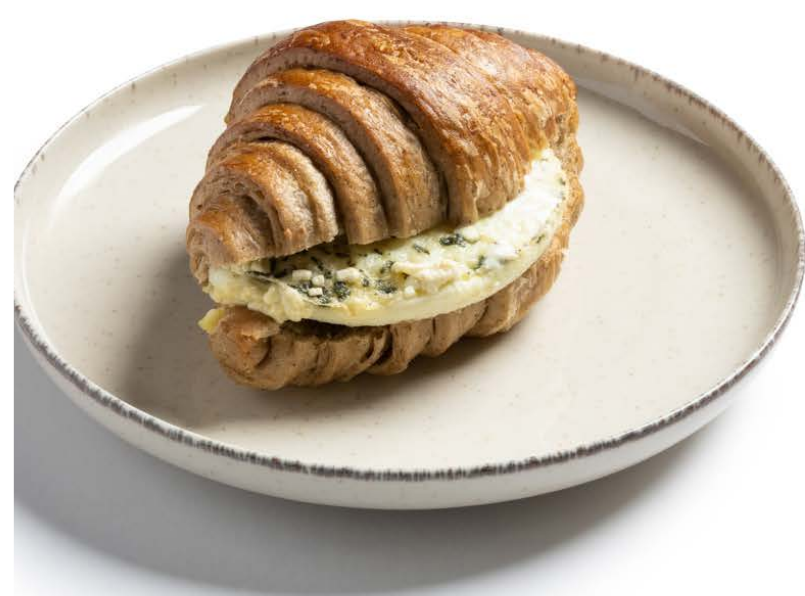
Egg White Omelette Croissant