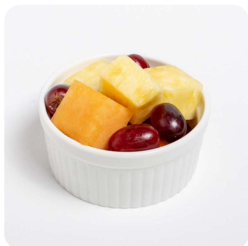
Seasonal Fruit Salad