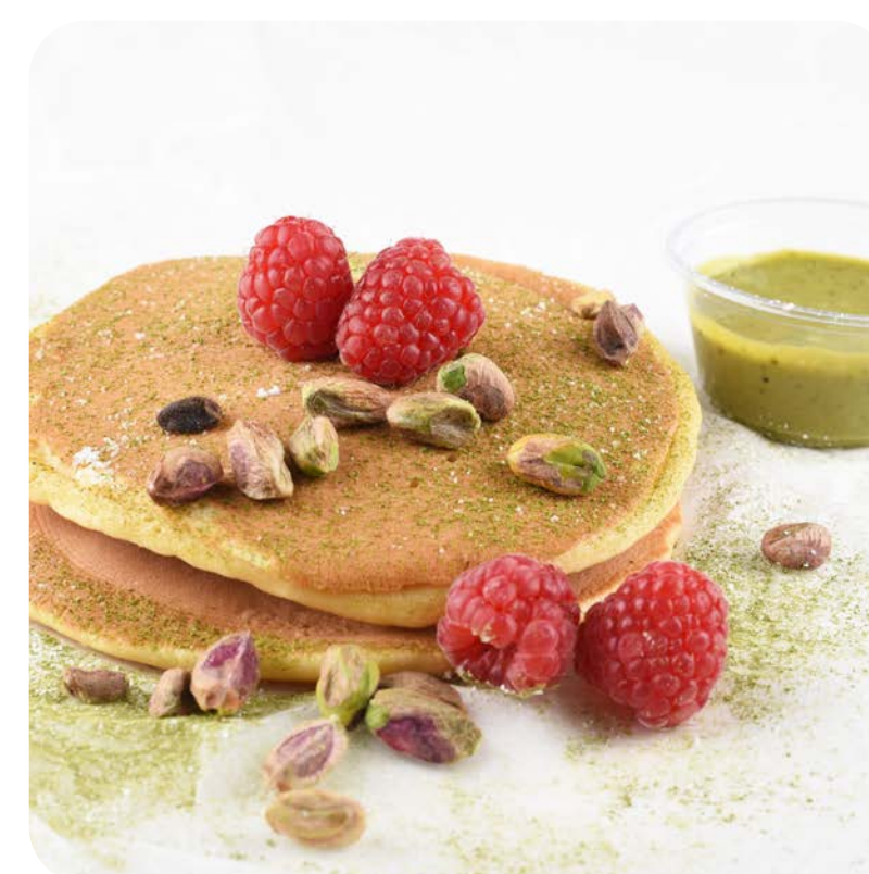
Japanese Pacakes with Matcha and Pistachio