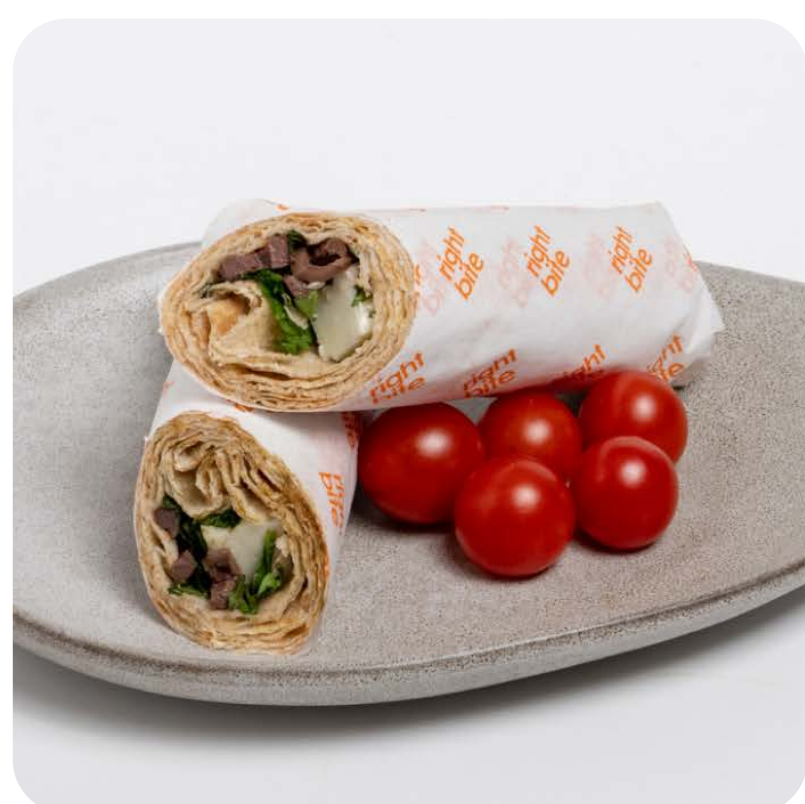
Lebanese Breakfast with Halloumi Cheese