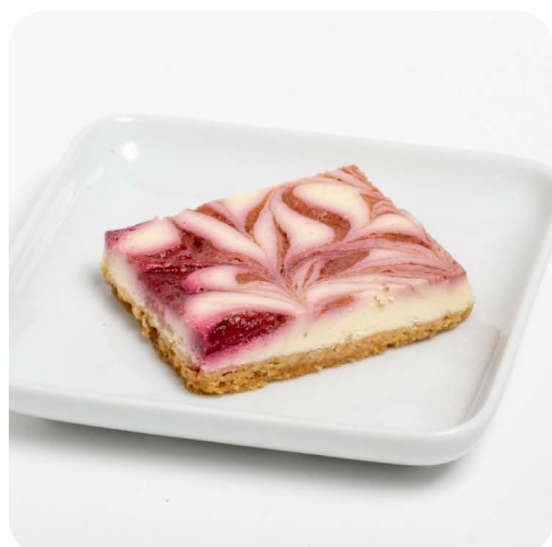
Raspberry Swirl Cheesecake