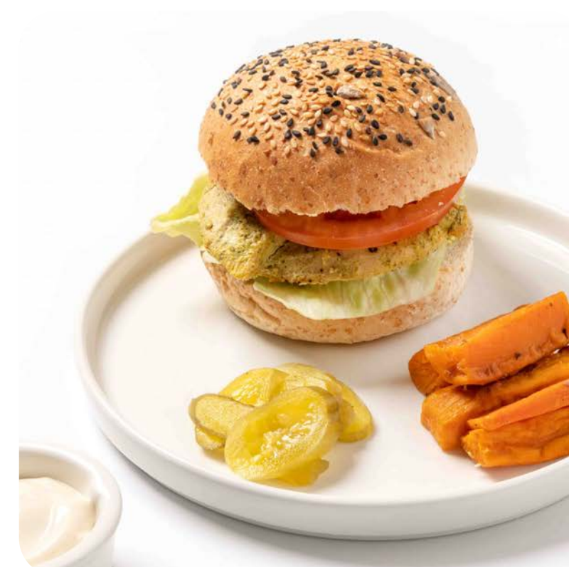
Chicken Burger with Roasted Sweet potato