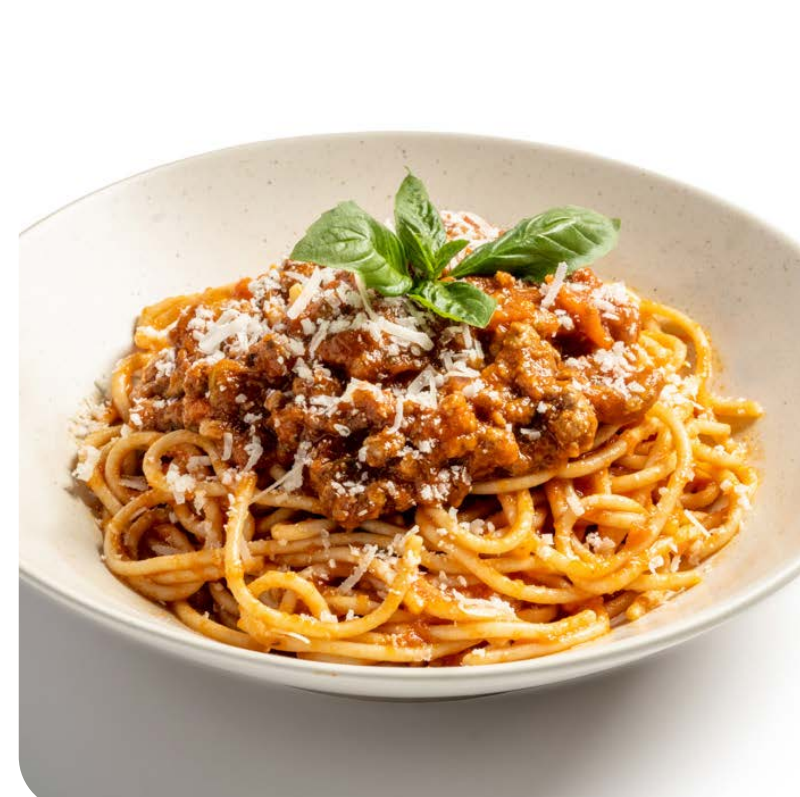
Whole Wheat Spaghetti