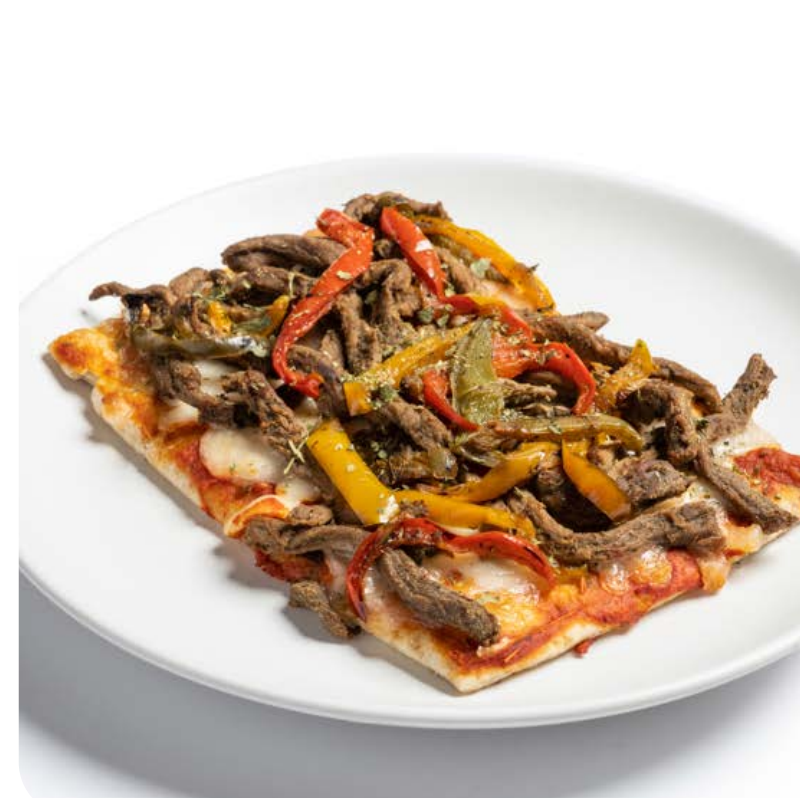
Cheese Steak Pizza