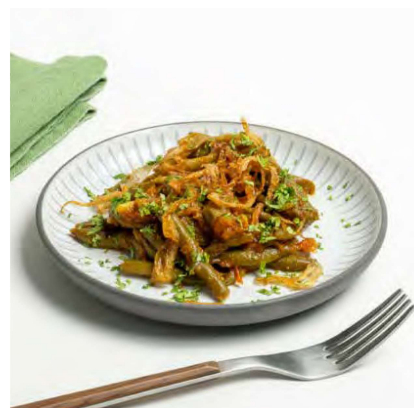
Loubieh bi Zeit