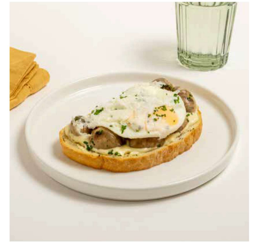
Mushroom & Egg Toast