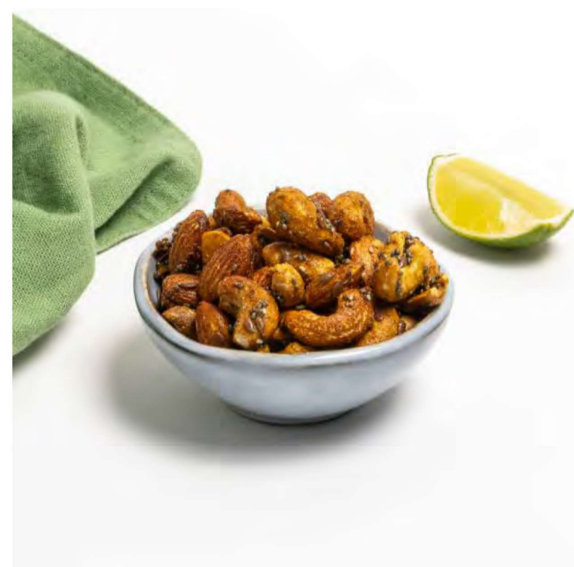
Citrus Curry Nuts with Chia Seeds