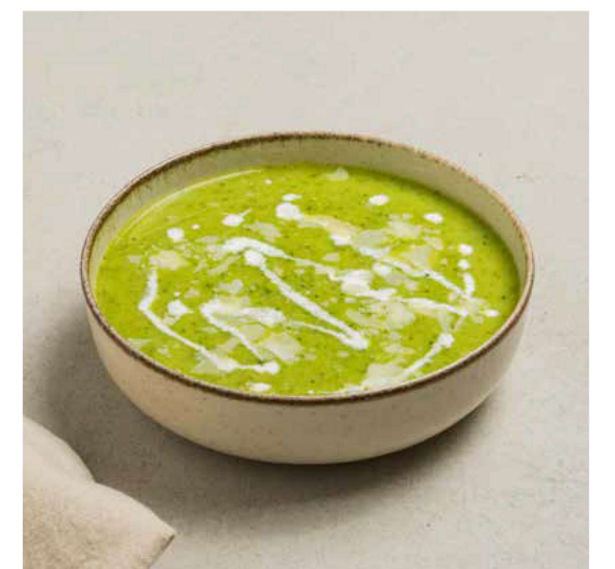
Broccoli & Parmesan Soup