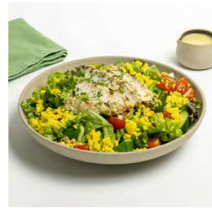
Honey Mustard Chicken Salad