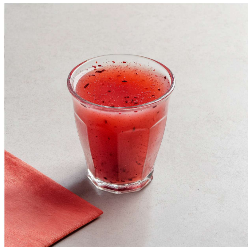
Mixed Berry Fibre Shot