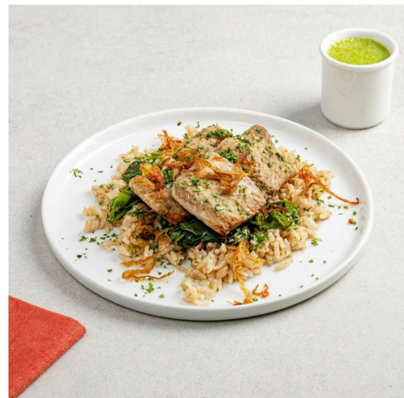
Roasted Bali Fish With Brown Rice