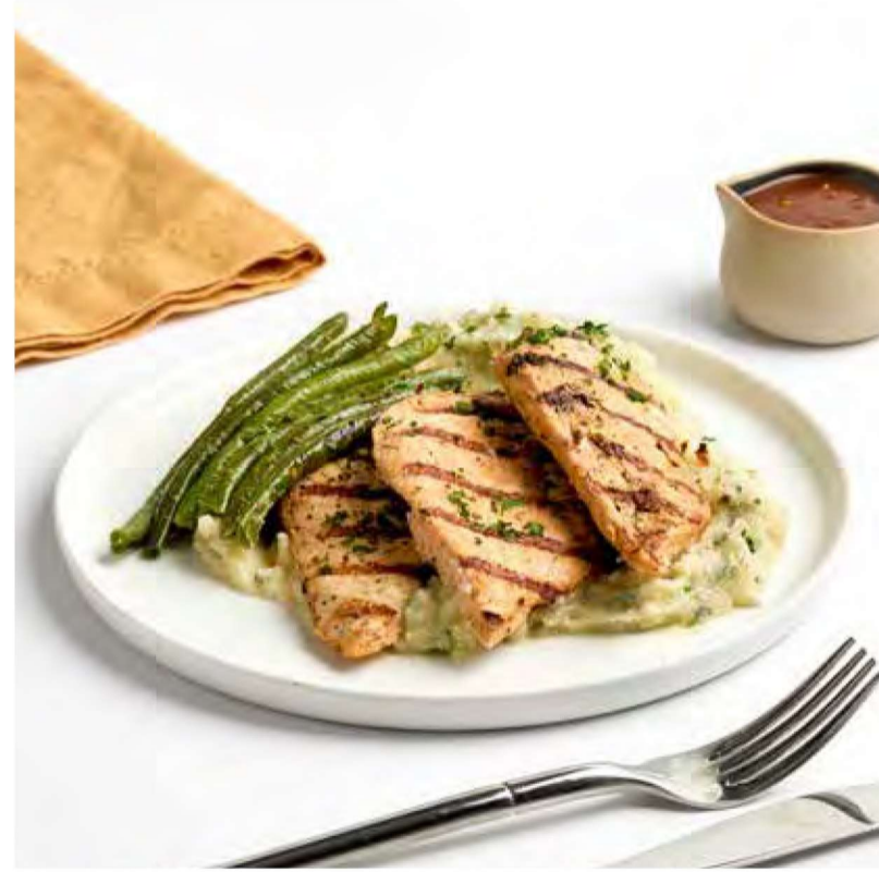
Grilled Chicken Robert