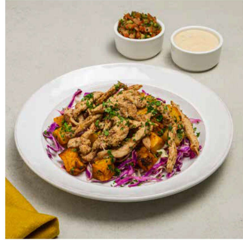
Chicken Shawarma Shaker