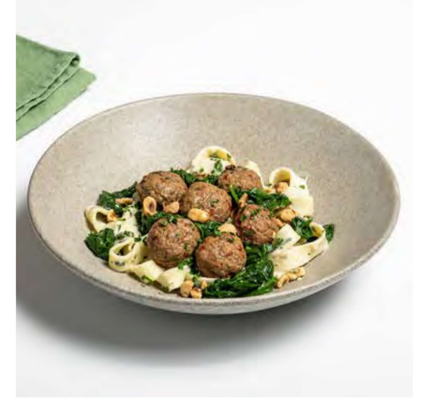
Tuscan Sausage Fettuccini