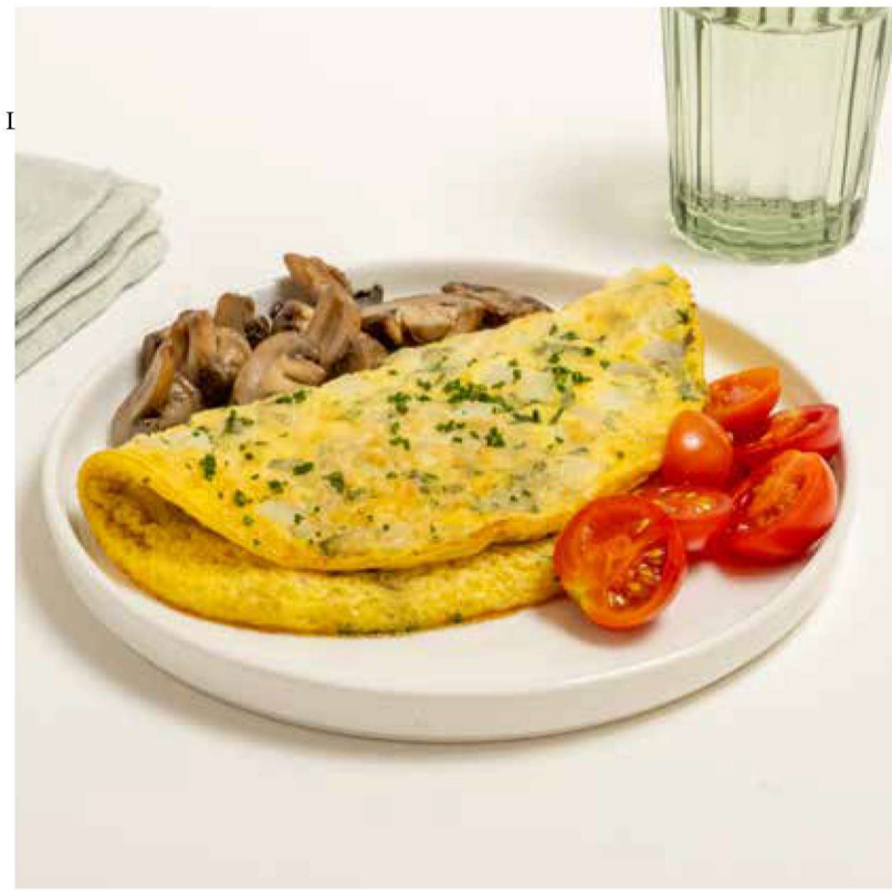
Baked Asparagus Eggs