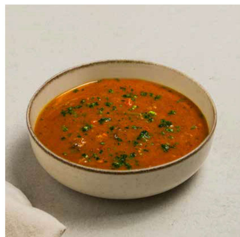
Farmhouse Vegetable Soup