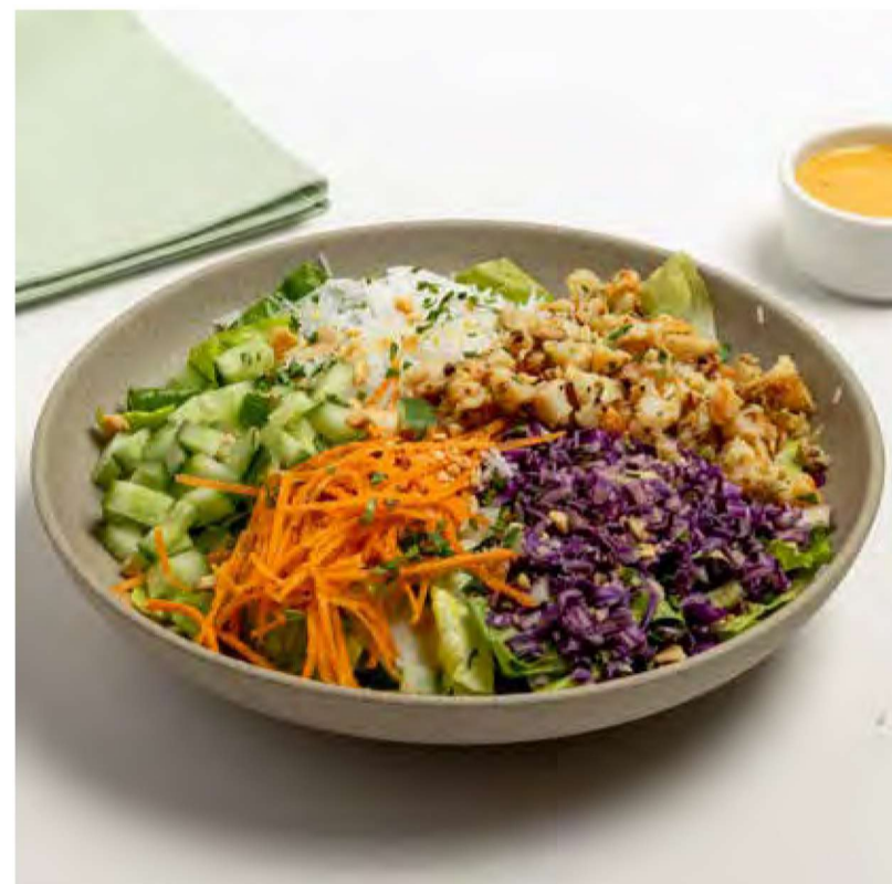
Sweet Chili Shrimp Chopped Salad