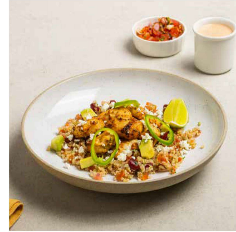
Chicken Burrito Bowl