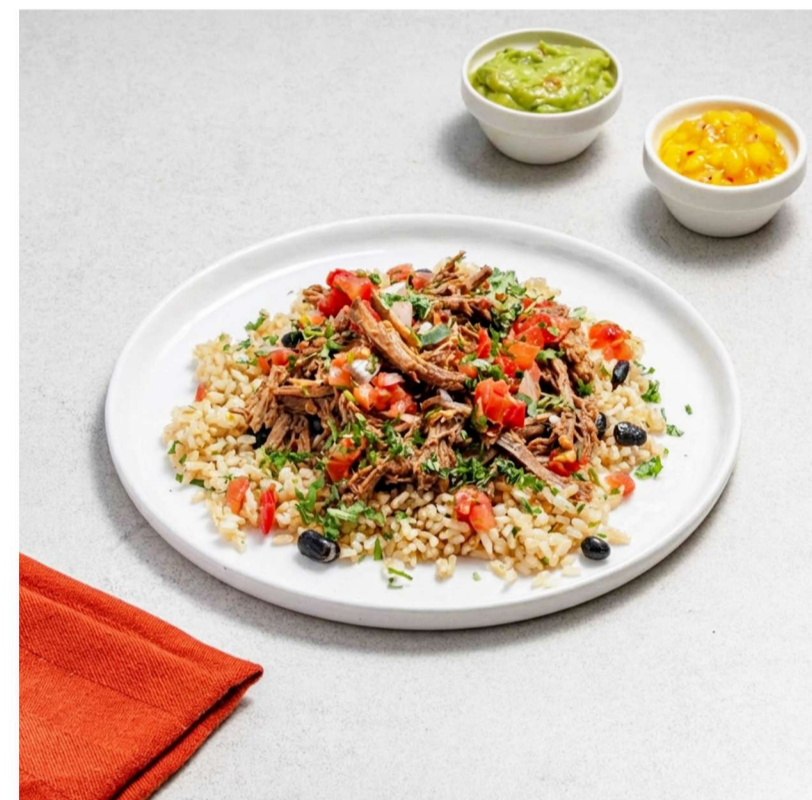
Pulled Beef Birria