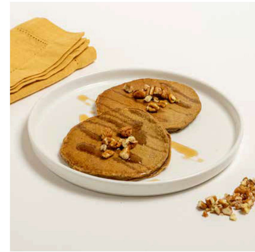
Pumpkin Spice Pancakes