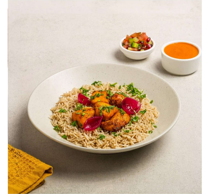
Butter Chicken With Brown Rice