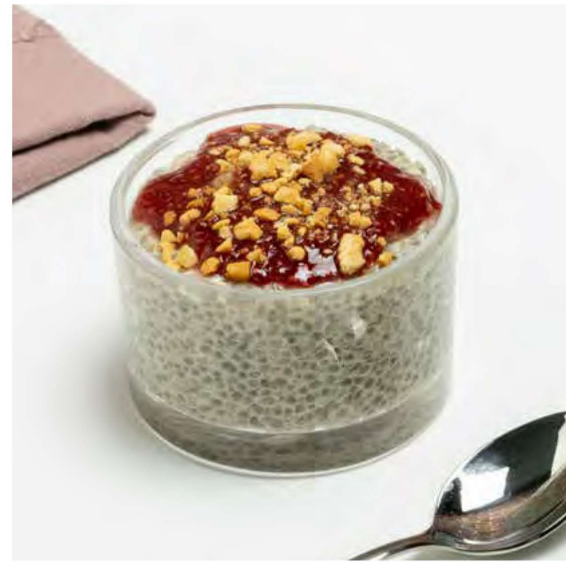
Peanut & Strawberry Chia Bowl