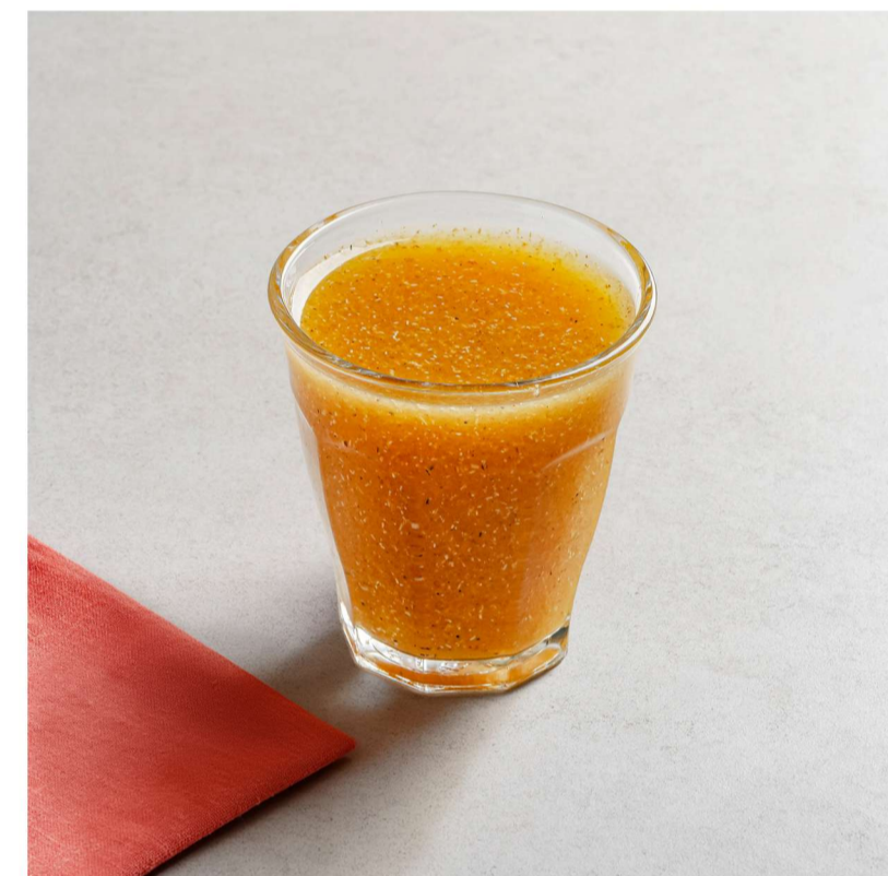
Passionfruit Fibre Shot