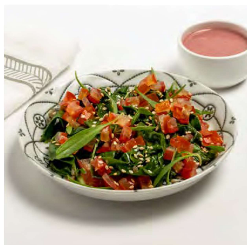
Spinach Zaatar Salad