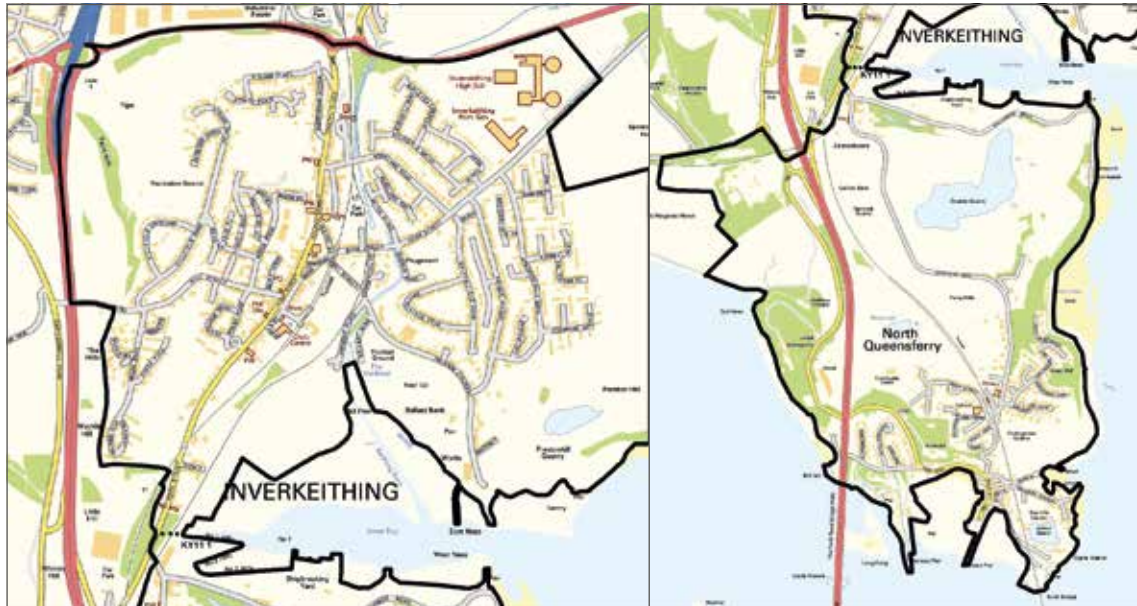
Map 1: Supplementary consultation focused areas – Inverkeithing and North Queensferry