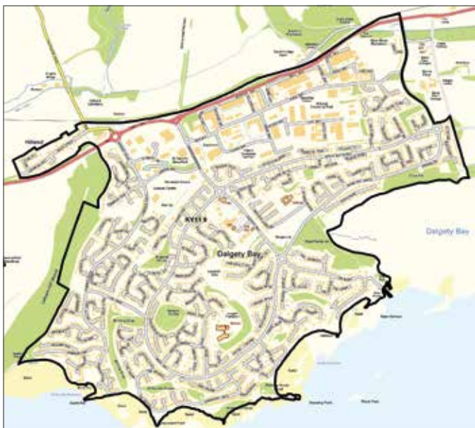
Map 2: Supplementary consultation focused areas – Dalgety Bay